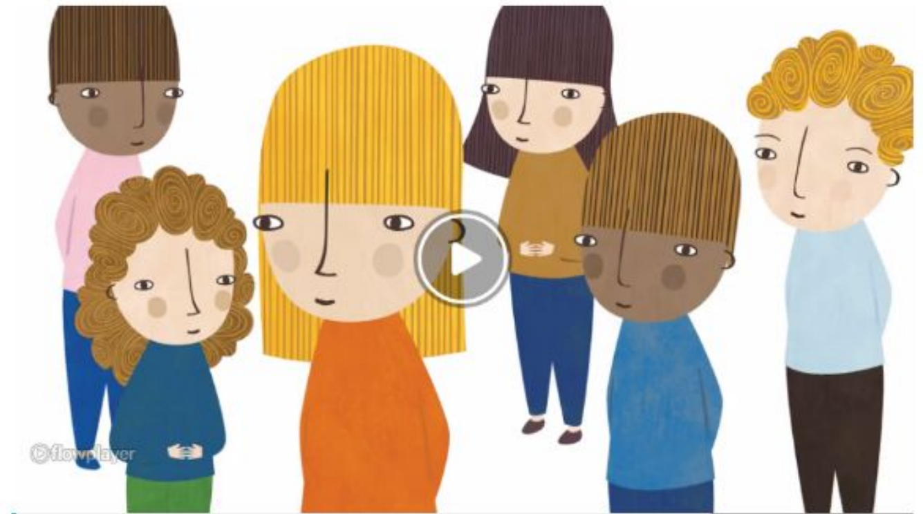
Video: Identifying signs of abuse