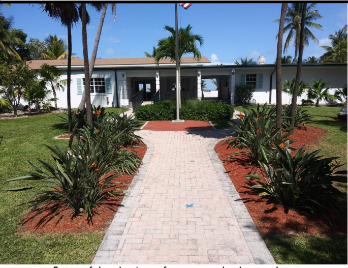
Some of the plantings of our recent landscape plan

What an inviting sight, blue skies, white sand, turquoise ocean and the well-manicured grounds of the Beach Club. We hope you like the look of the entrance way. There is a little more to do in our landscape plan but what a change from a year ago. I want to thank Board member Craig Hardie for all the time and effort he put into seeing this project through. Well done!