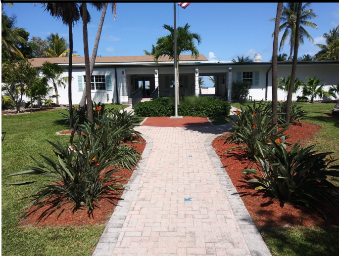
Some of the plantings of our recent landscape plan

What an inviting sight, blue skies, white sand, turquoise ocean and the well-manicured grounds of the Beach Club. We hope you like the look of the entrance way. There is a little more to do in our landscape plan but what a change from a year ago. I want to thank Board member Craig Hardie for all the time and effort he put into seeing this project through. Well done!