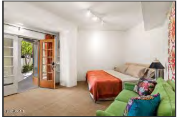
Guest Casita shares covered patio overlooking Rose Garden. Use for Guests or as an office.