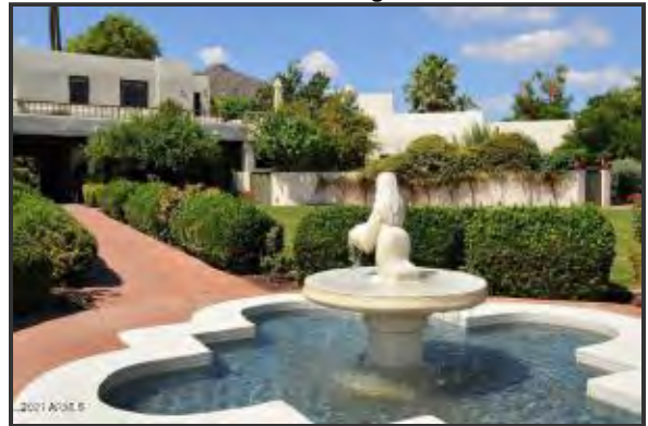
The original Honeymoon Suite and adjacent guest casita share a private patio, with Camelback Mountain in the background