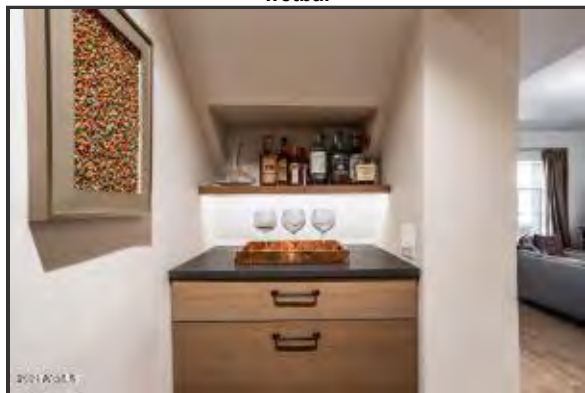
Refrigeration drawers cleverly integrate into decor