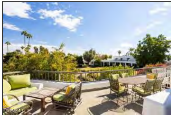
Roof deck space extends the square footage for entertaining and waiving to the amazing neighbors living here at Casa Blanca