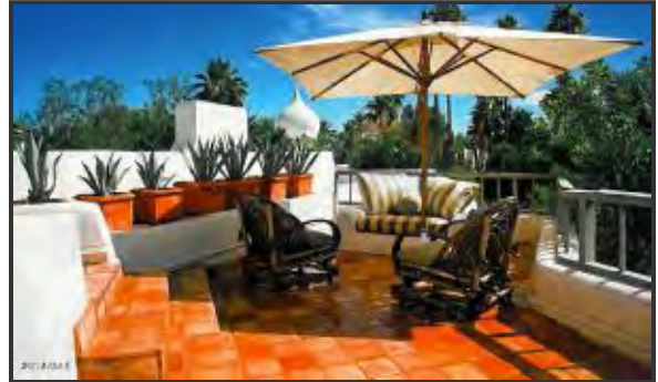
Featured in the Phoenix Home and Garden

Originally built as the Wrigley family's winter home in the 1920s, it was converted into the famed Casa Blanca Inn, where dignitaries, politicians and movie stars frequented for decades.