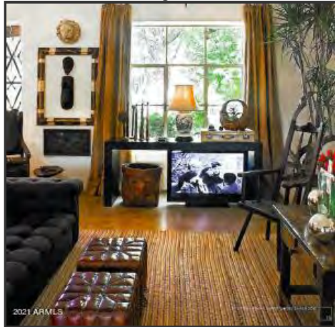
Featured in the Phoenix Home and Garden