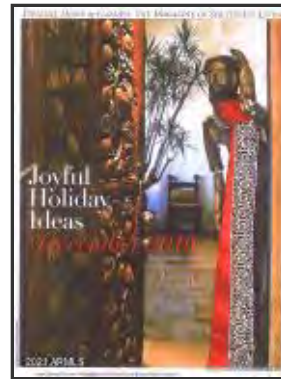
Phoenix Home & Garden ran a photo spread and narrative to give you a real feel for the cottage. Under 'Documents' tab.