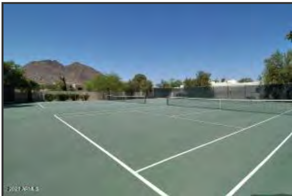
Views of Camelback Mountain from throughout the community