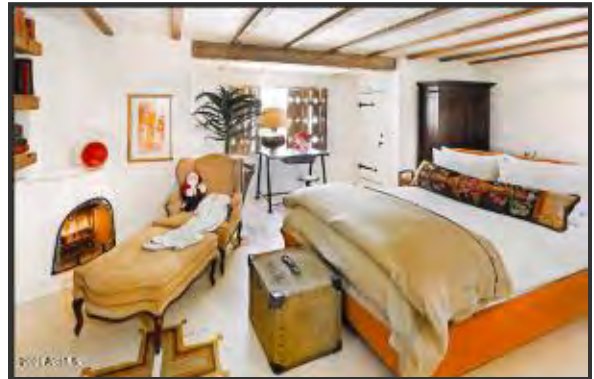
Featured in the Phoenix Home and Garden