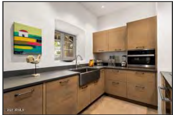
Modern Kitchen integrates the Adobe architecture that makes this true Casa Blanca