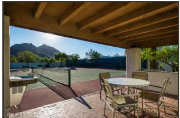
An active walkable lifestyle here