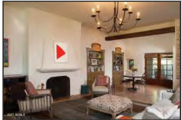
Entering into Great Room from Front Door. French Pane Doors adjacent dining enter patio overlooking Rose Garden