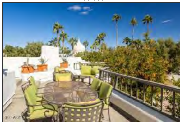
Spiral Staircase also leads guests to rooftop deck for views of Camelback, Sunsets and the Rose Garden