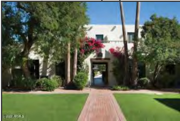
Front brick walkway to beautifully hand carved wood entrance door on your left