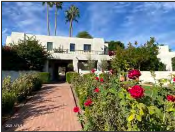
brick walkway to front door and patio of #2