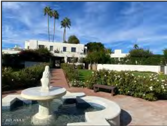
brick walkway to front door and patio of #2