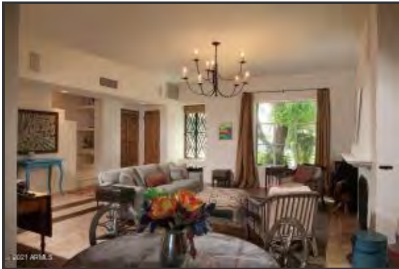
Enter into the warmth and beauty of historic charm, modernized perfectly for your comfort