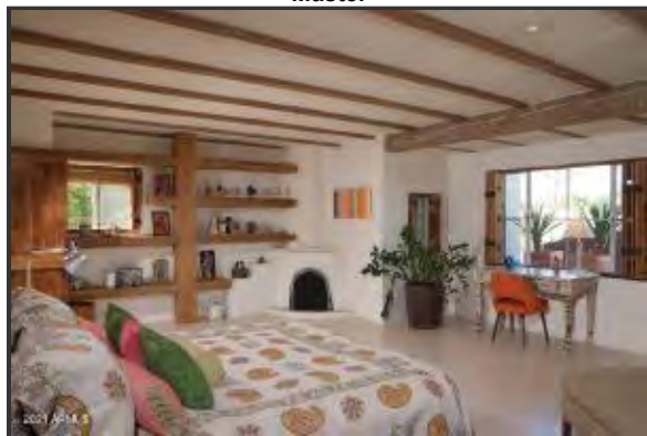
Master Suite is up its own private staircase with access to a fabulous rooftop deck