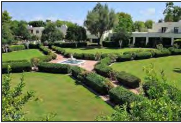
Stroll through history in this walkable community, which wraps completely around a fabulous lush green rose garden