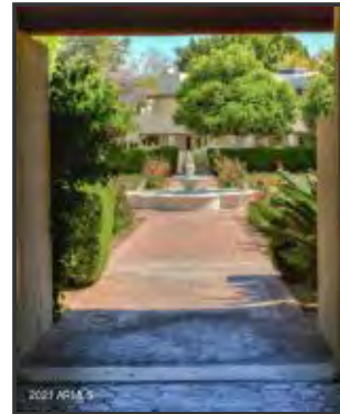
Front doorway reveals entrance to the central iconic Rose Garden