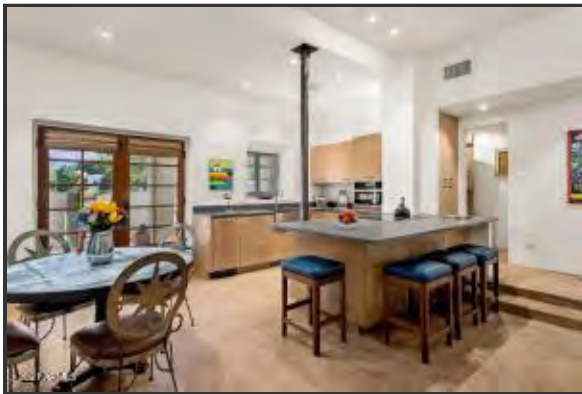
Adjacent Kitchen and Dining are Doors leading to covered patio overlooking Rose Garden Patio