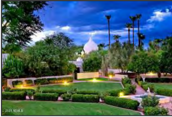
Historic Casa Blanca Rose Garden