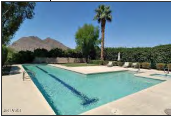
3 heated pools/spas, each with its own unique features and character