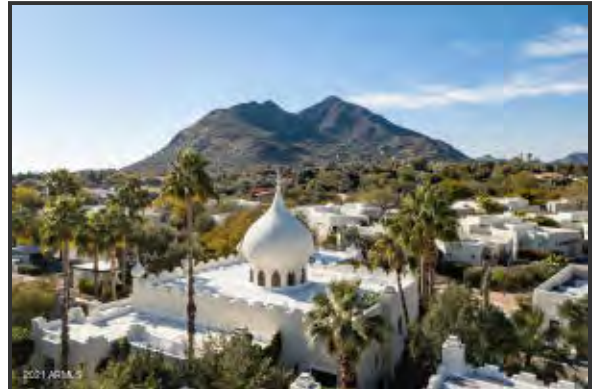
The iconic crossed-arch domed cupola can be seen with Camelback Mountain as backdrop