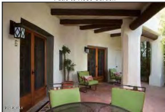
Covered Patio leads to guest casita and overlooks Rose Garden