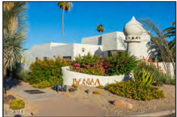
24 Hour Guard Gated, the iconic domed focal point was once used as the restaurant of the Casa Blanca Inn