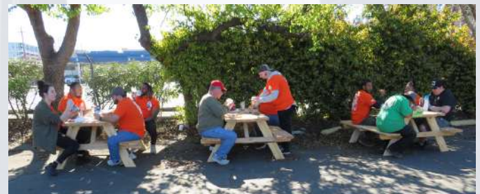
Lunching on the new furniture