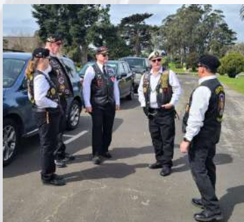
ALR debrief after one of many ceremonial details in March