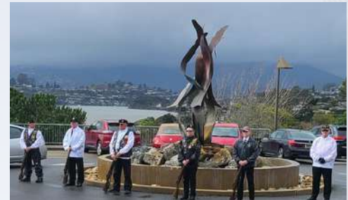
Despite inclement weather, Riders braved the cold to perform last honors ceremonies for two Navy veterans in San Bruno & Pacifica, respectively.