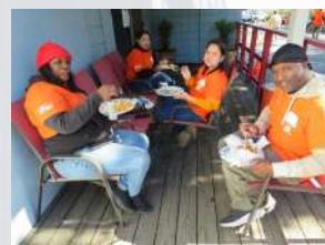
HD volunteers enjoying their lunch on new outdoor seating.