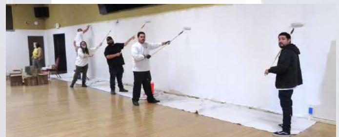
Brightening up the Hall's walls