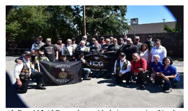
AL Post 105 ALR members with their supportive friends of Golden Gate "HOG" Chapter in San Francisco, as well as members of Blue Star Moms and Auxiliary Unit 105.