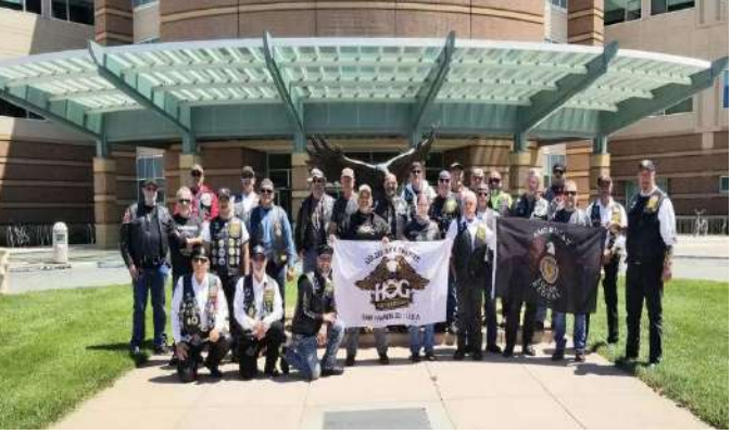
AL Post 105 ALR members with their supportive friends posting for pictures at the Palo Alto VA Hospital with their mission accomplished.