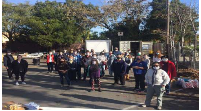
Auxiliary Unit 105, Forester Financial, National Charity League, Rotary, and Young Mens Service League helping Blue Star Moms with the veterans project.