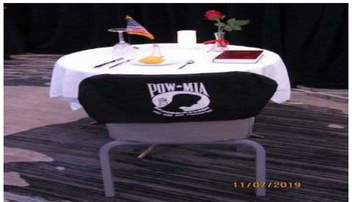
Always remembering our comrades at veteran activities to honor their military services and will never be forgotten.