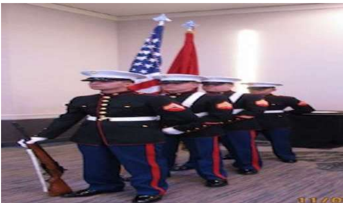
23 rd Marine Division Honor Guard in action during the AL Post 105 veteran services for 100 years celebration.