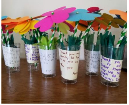
Foster City Girl Scouts Troop 61829 decorative flowers and messages of appreciation!