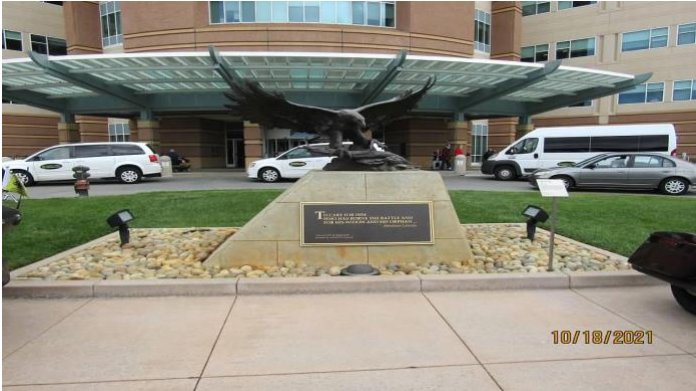
The front area location of therein VA Palo Alto Healthcare, and ALR Chapter 105 preparing to handover their support fundraising check for veterans Suicide Prevention.

The Post 105 participates in various local and state veteran events for supportive services for veterans and their families. The following pictures illustrating examples of Post 105 supportive services for veterans and their families during an event in local communities. It's the post commitment for quality services supporting our veterans and their families – exemplifying by action throughout communities!