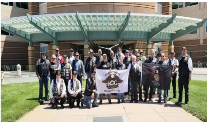
AL Post 105 ALR members with their supportive friends of Golden Gate "HOG" Chapter in San Francisco in front of VA Palo Alto Healthcare – mission accomplished!