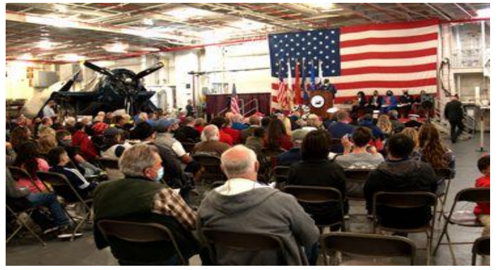
Participants at the USS Hornet Veterans Day Celebration on November 11, 2021.