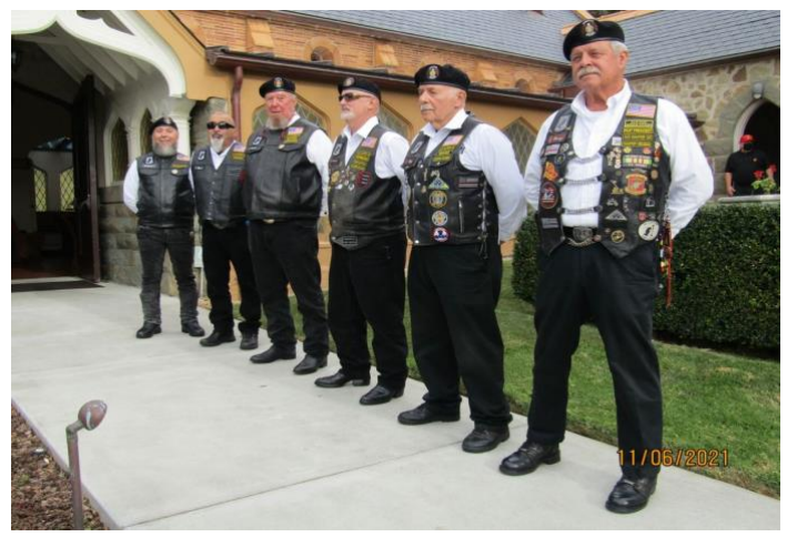
ALR Post 105 Family members during a Flag Retirement Ceremonial event on November 6, 2021.