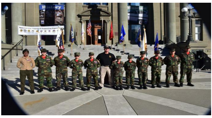
Golden Gate Young Marines at the Veterans Day Celebration in Redwood City on November 11, 2021.