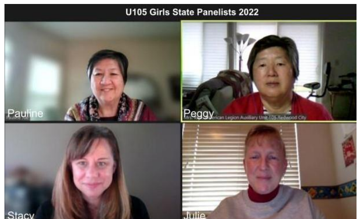
Auxiliary Unit 105 California Girls State Panel members.