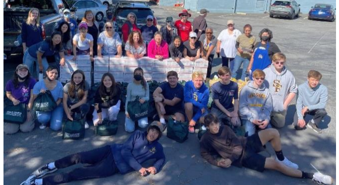
ALA Unit 105 team and San Mateo County Blue Star Moms joined National Charity League, Young Mens Service League, and Forrester Financial volunteers for therein Packing Day on May 14, 2022 at Post 105.