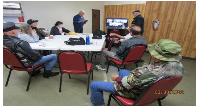
The commander is presenting Vietnam Veteran Lapel Pins to veterans who served in the Vietnam War.