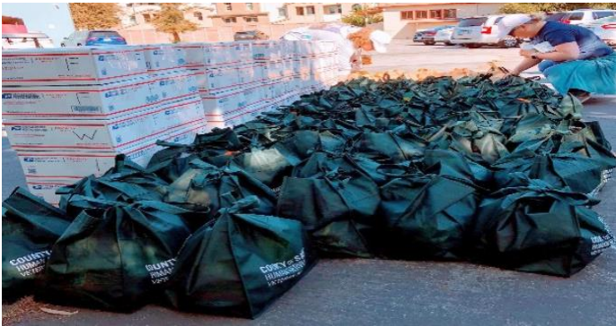
The San Mateo County Blue Star Moms Packing Day was successful with all herein boxes and care bags for veteran troops at Post 105.