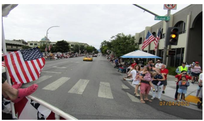
Post 105 float going down the parade street with people watching at downtown Redwood City.