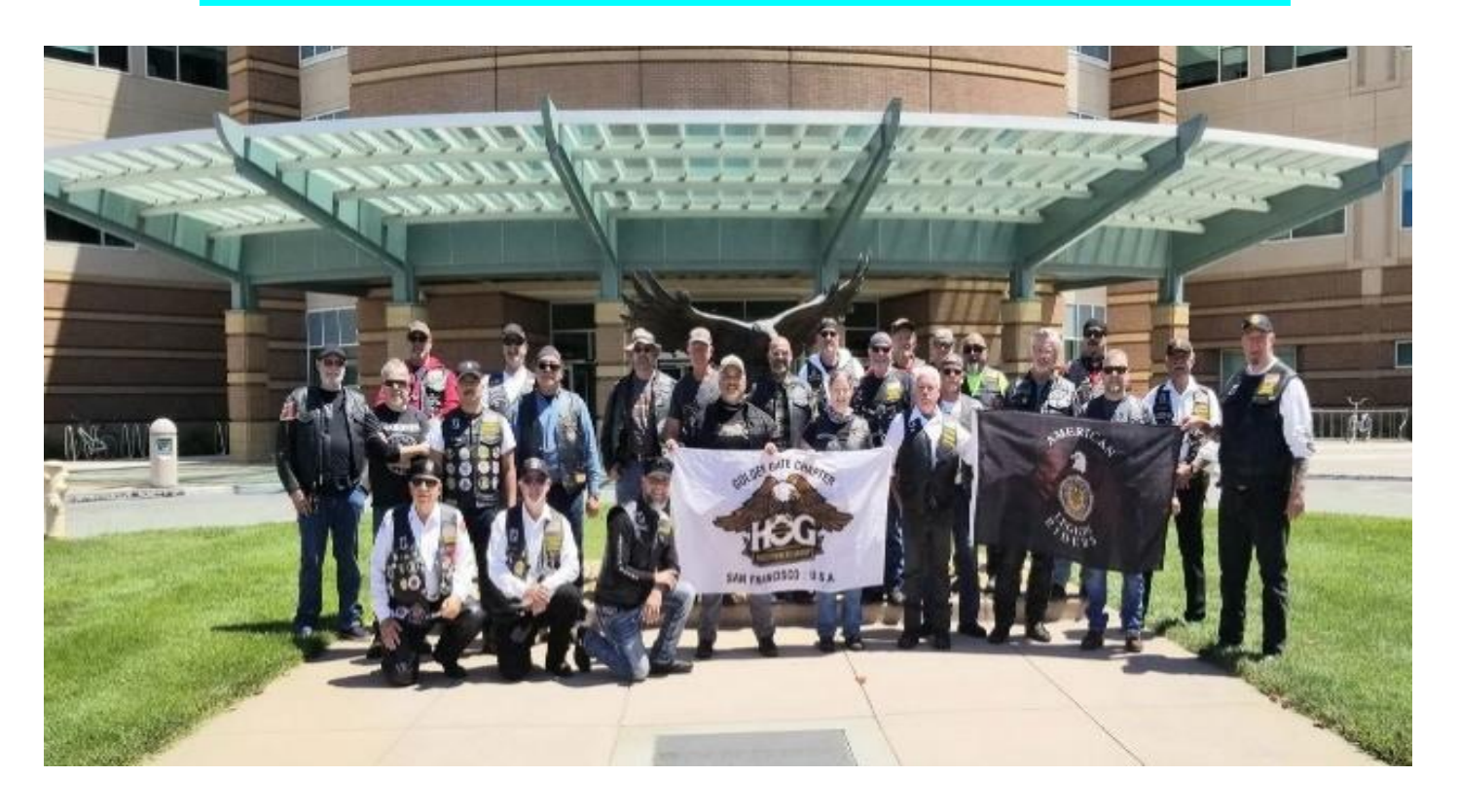
The AL Post 105 Riders were able to partner with HOG (Harley Owners Group) riding team members for thereby Annual Suicide Prevention Ride. The annual event is to raise funds to help veterans prevent suicide at therein Palo Alto VA Medical Center. It's a 22 mile ride for a great healthy cause to help veterans and their families, and they raised $4,347 to assist veterans.