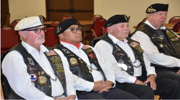
Post 105 ALR membership attends therein Commanders Coffee event at the post.

The Post 105 participates in various local and state veteran events for supportive services for veterans and their families. The following pictures illustrating examples of Post 105 supportive services for veterans and their families during an event in local communities. It's our post commitment for quality services supporting our veterans and their families – exemplifying by action throughout communities! (THANKS to all photographers for pics)