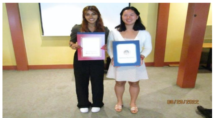
Two Post 105 Girls State participants displaying their Certificates of Appreciation during their luncheon at Hobbies Restaurant.