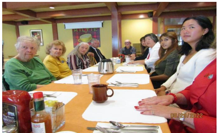
AL Post 105 Family units with Girls State participants during their appreciation and celebration luncheon!