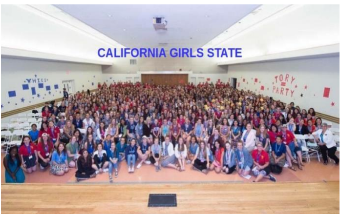
Post 105 Girls State participants are part of thereby state conference for all participating state post organizations.