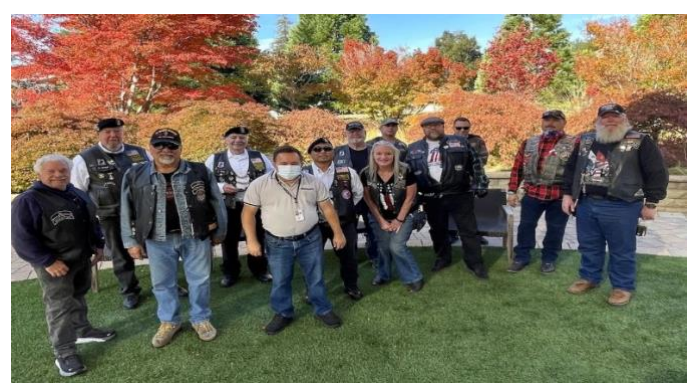
ALR105 and ALR82 with HOG members collaboration preparing to present their suicide prevention financial support to Palo Alto VA Hospital.