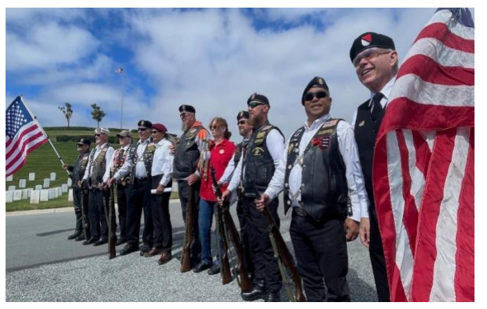
ALR105 and ALR82 with HOG members honoring veterans Purple Hearts Day.