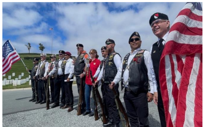
ALR105 and ALR82 with HOG members honoring veterans Purple Hearts Day.