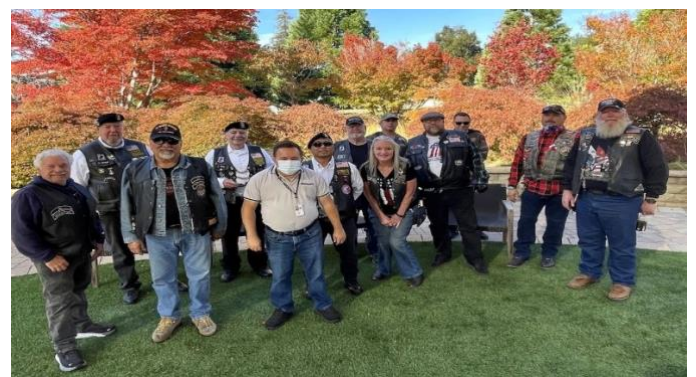
ALR105 and ALR82 with HOG members collaboration preparing to present their suicide prevention financial support to Palo Alto VA Hospital.