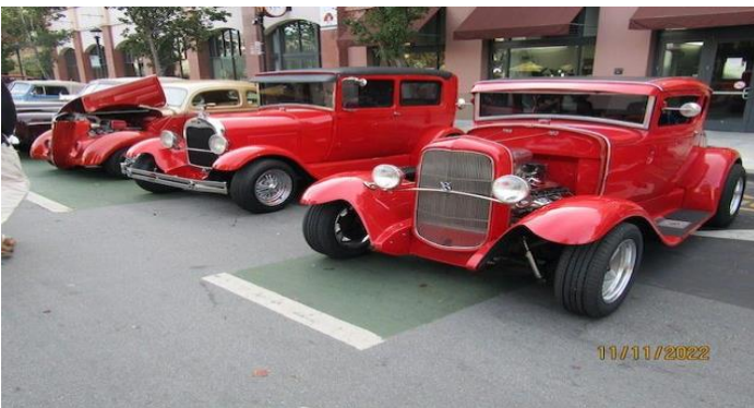
Classical cars display at therein 2022 Veterans Day event for participants to view.