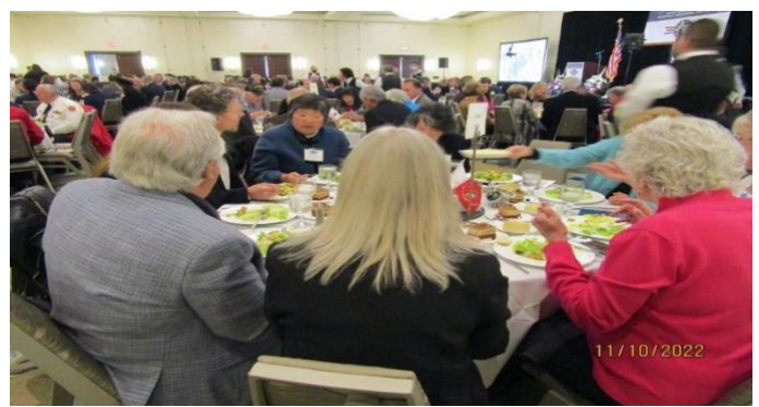
Participants at therein 7 th Annual Veterans Recognition Luncheon enjoying their meals.