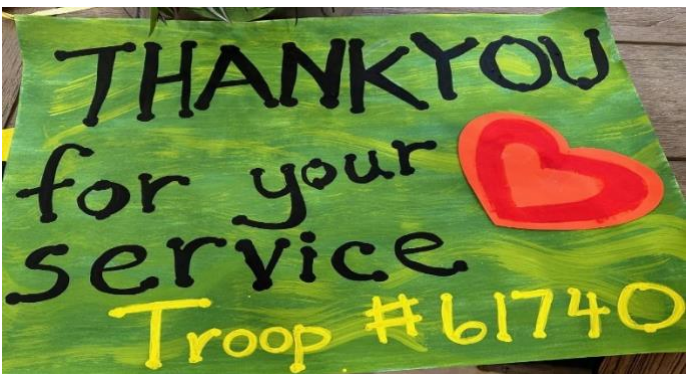
College Park Girl Scouts sharing their support, and remembering veterans on St. Valentines Day with THANKFUL regards for their military services.