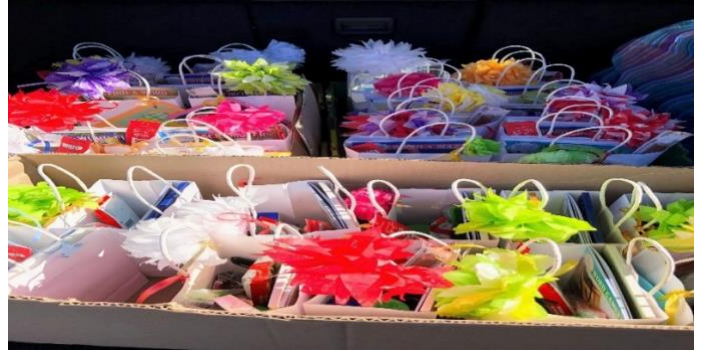
Contributed gift bags were full of goodies and snacks, note pads, pencils, puzzle books, and hand sanitizers with creative handmade flowers.