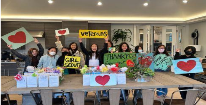
College Park Girl Scouts Troop 61740 provided handmade gift bags for veterans at therein VA Menlo Park Medical Center on St. Valentines Day 2/14/2023.

The Post 105 participates in various local and state veteran events for supportive services for veterans and their families. The following pictures illustrating examples of Post 105 supportive services for veterans and their families during an event in local communities. It's our post commitment for quality services supporting our veterans and their families – exemplifying by action throughout communities! (THANKS to all photographers for pics)