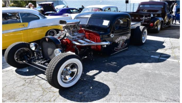
More classic cars at therein AL Post 105 successful event.