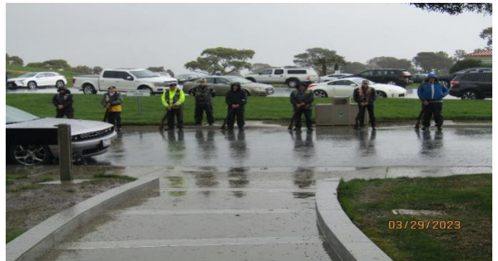
ALR Post 105 Chapter at the Golden Gate National Cemetery during thereby Vietnam Veterans Memorial ceremony event.