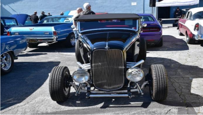
AL Post 105 Family classic car showcase was a successful event in April 2023!

The Post 105 participates in various local and state veteran events for supportive services for veterans and their families. The following pictures illustrating examples of Post 105 supportive services for veterans and their families during an event in local communities. It's our post commitment for quality services supporting our veterans and their families – exemplifying by action throughout communities! (THANKS to all photographers for pics)