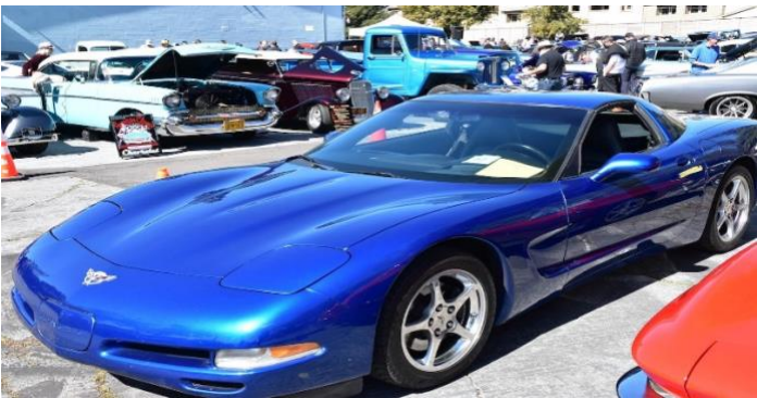
More classic cars at therein AL Post 105 successful showcase of classical cars event. The classic cars event was very successful and received more cars than expected.