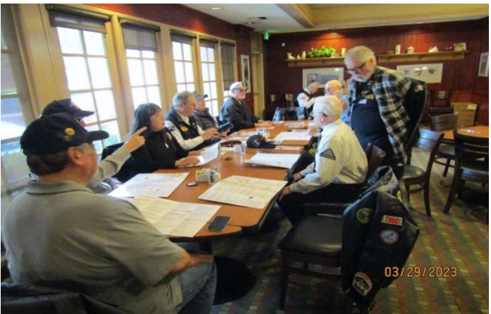
Legionnaires of AL Post 105 and AL Cathay Post 384 with veteran friends preparing to get their well-deserved meals. after therein Vietnam Veterans Memorial ceremony.