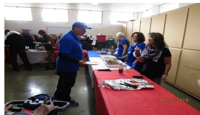
Cooking team serving food for people at Post 105 during the 100 years celebration.