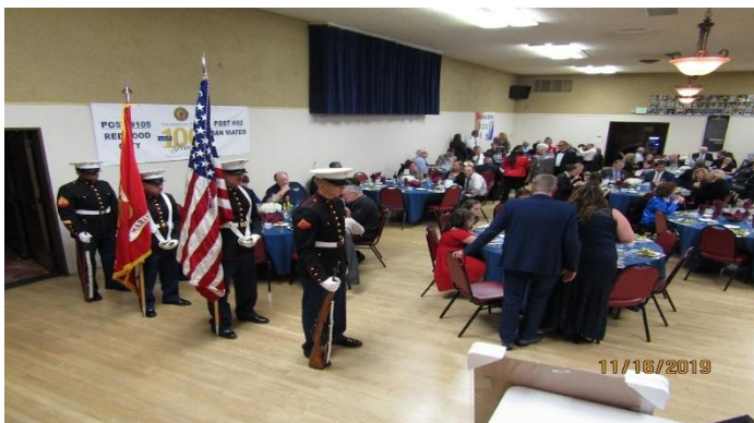
23 rd Marine Division Honor Guard prepping for the gala celebration event.