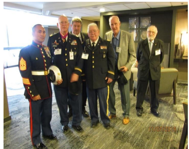
4 th annual event program to honor veterans for their distinguish services.