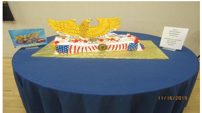
Gala Event celebration cake! People enjoyed the cake thereafter singing happy birthday.