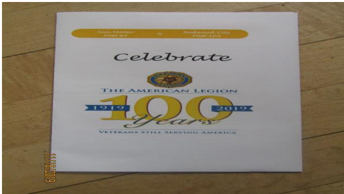
Gala Event Program for the 100 years celebration!

The 100 years centennial celebration events were done in two different days. The pictures above were taken on November 11, 2019 during celebration activities on Veterans Day at Redwood City Downtown Square, and American Legion Post 105. The pictures below were taken on November 16, 2019 during the Gala Dinner event at Post 105. It was a great successful celebration event for Post 105 and Post 82 – great team effort!