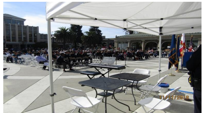
People arriving for the celebration and resting at appropriate seating arrangements.