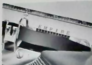
When it is necessary to re-insert the paper, the exact writing position is easily regained by the use of the line guide.