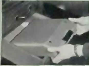
The EMPIRE Aristocrat in its case can be put away in a shallow drawer.

with this compactness and portability . . .