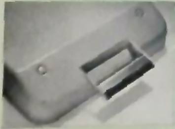
The neat handle slides back flush with the case for easy storage or packing. Case locks automatically.