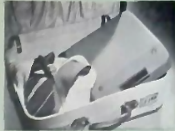
It can be carried in a small dressing or attache case.