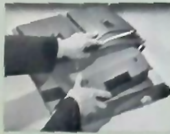
It will slip into an ordinary brief case for a journey by plane, car or train.