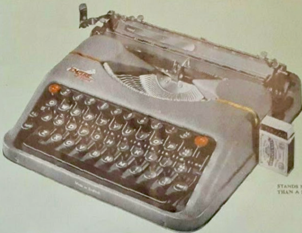
STANDS NO HIGHER THAN A MATCHBOX