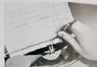
Vertical and horizontal lines can be drawn by inserting the point of a pencil in the hole provided in the card grip, and moving the carriage.