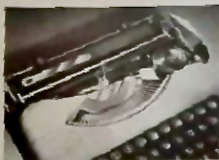
The neatly designed ribbon covers keep the ribbon free from dust, and add to the appearance of the machine.