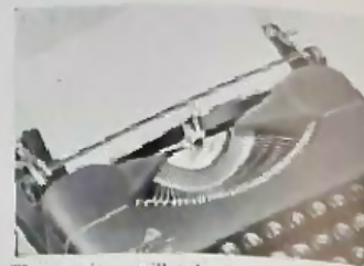
The carriage will take paper up to 9½" wide, and has a writing line of 92 Pica and 115 Elite characters.