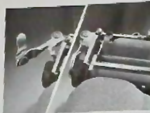
The line space lever is brought into operation by the touch of a button. When not in use it folds neatly at the side of the carriage.