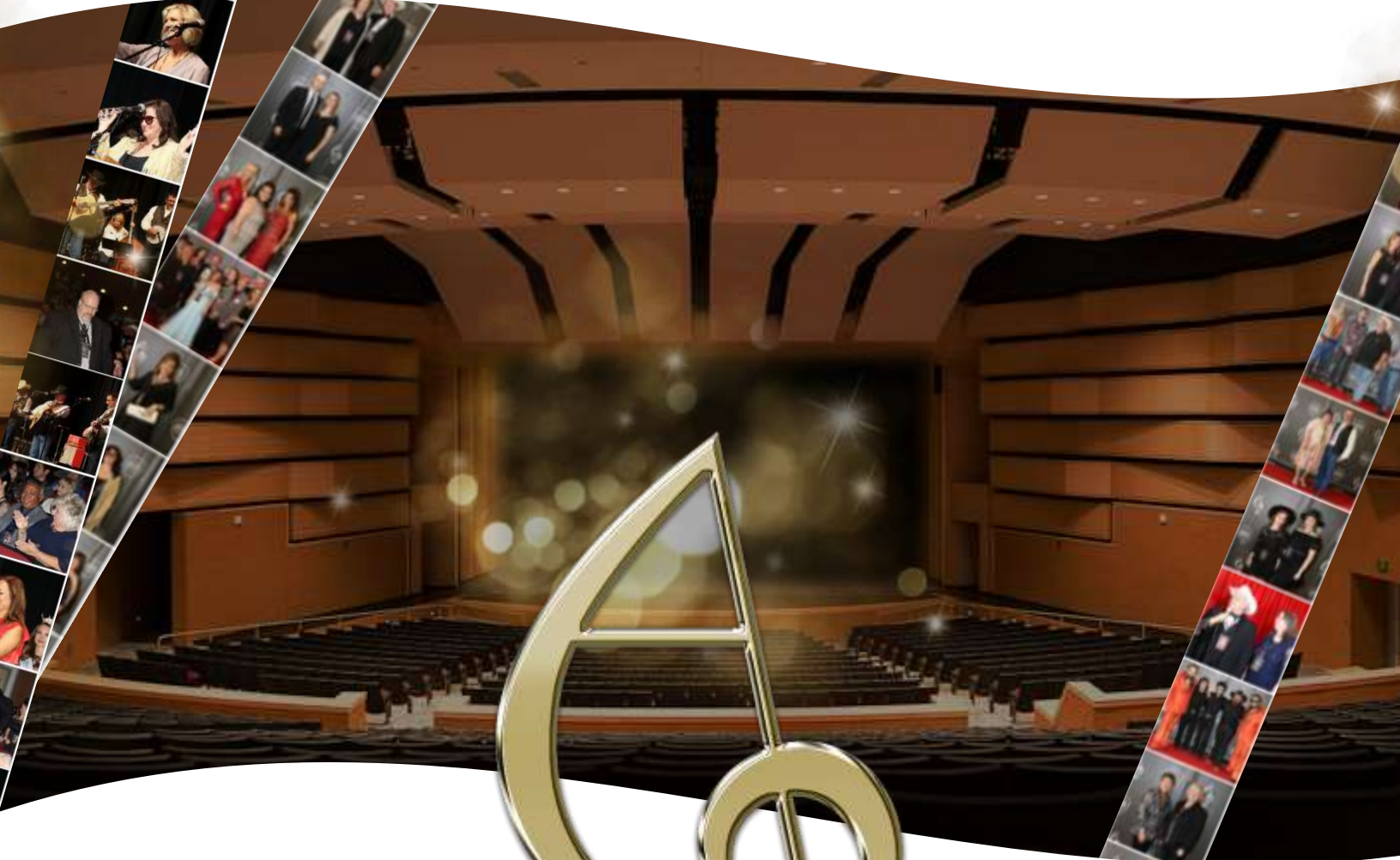
Maumelle High School Auditorium