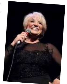
Tanya Tucker sings a tribute for Ed Bruce, Lifetime Achievement Award recipient.

Wayne Raney - Raney was a popular country singer and harmonica player. He grew up on a farm in Cleburne County, and scored a number one hit in 1949 with "Why Don't You Haul Off and Love Me." Raney impacted the music field in a number of ways, recording artist, songwriter, musician, disc jockey, record producer and as an owner of a record label.