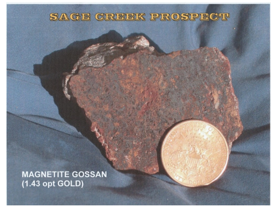
FIGURE 1 SAGE CREEK FLOAT SAMPLE ($20 GOLD PIECE FOR SCALE)