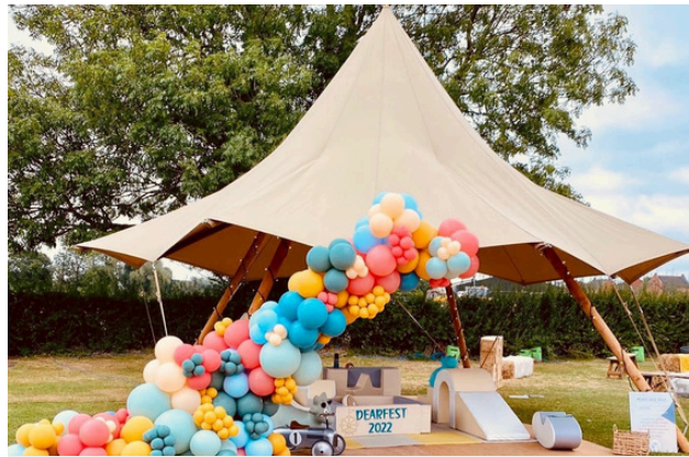
Little Hat Tipi - From £400 inc lighting