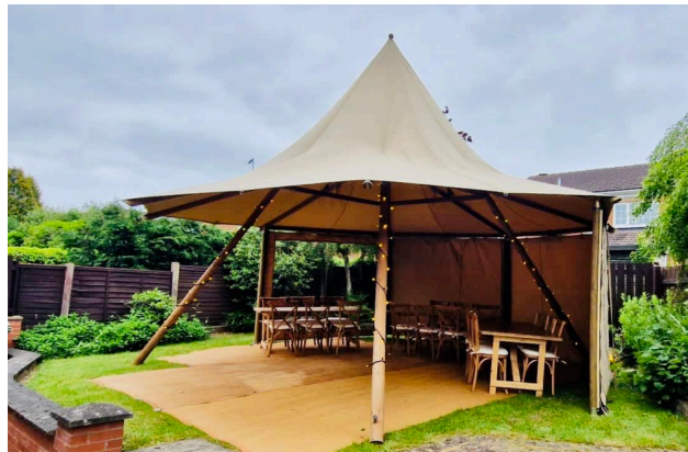
Little Hat Tipi Side Panels - From £25per panel