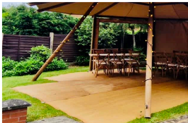
Little Hat Tipi Matting - From £50/per 10 metre roll