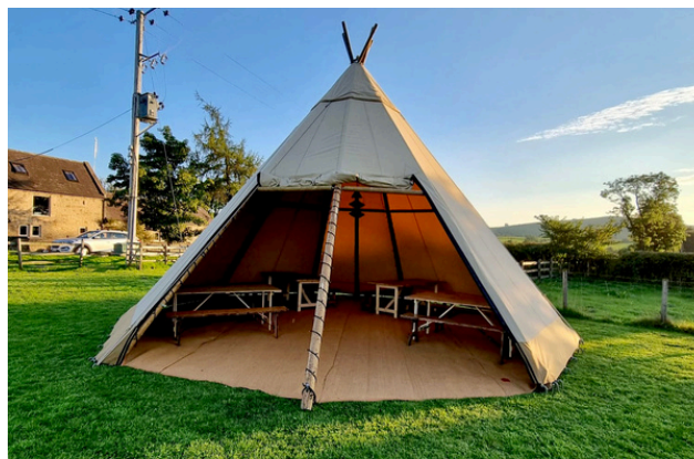
Single Midi Tipi includes lighting & flooring - From £1,100