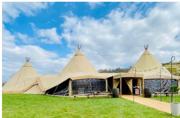
Midi Tipi Linked to Giant - From £1,100