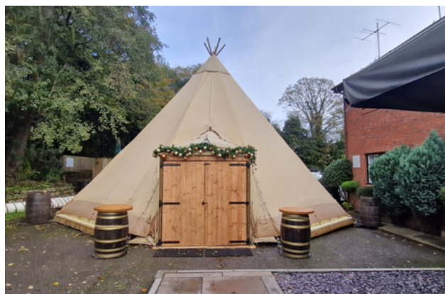
Midi Tipi with Wooden Doors & Hard Standing - From £1,500