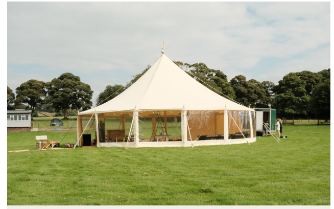
Sailcloth Marquee - From £1,900