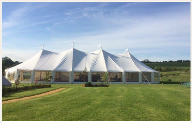
4 Pole Sailcloth Marquee - From £7,600