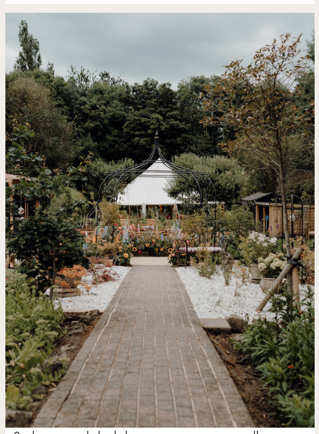
Guide price, includes lighting, matting, entrance walkway. Please note delivery and damage waiver to be added.