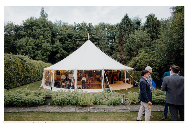
3 Pole Sailcloth Marquee - From £5,700