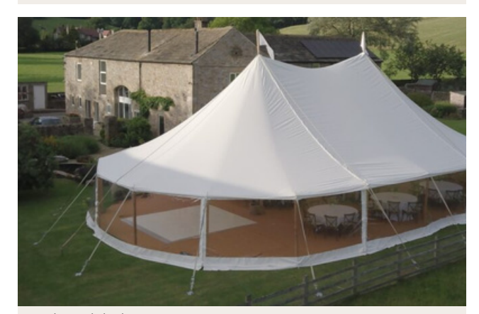
2 Pole Sailcloth Marquee - From £3,800