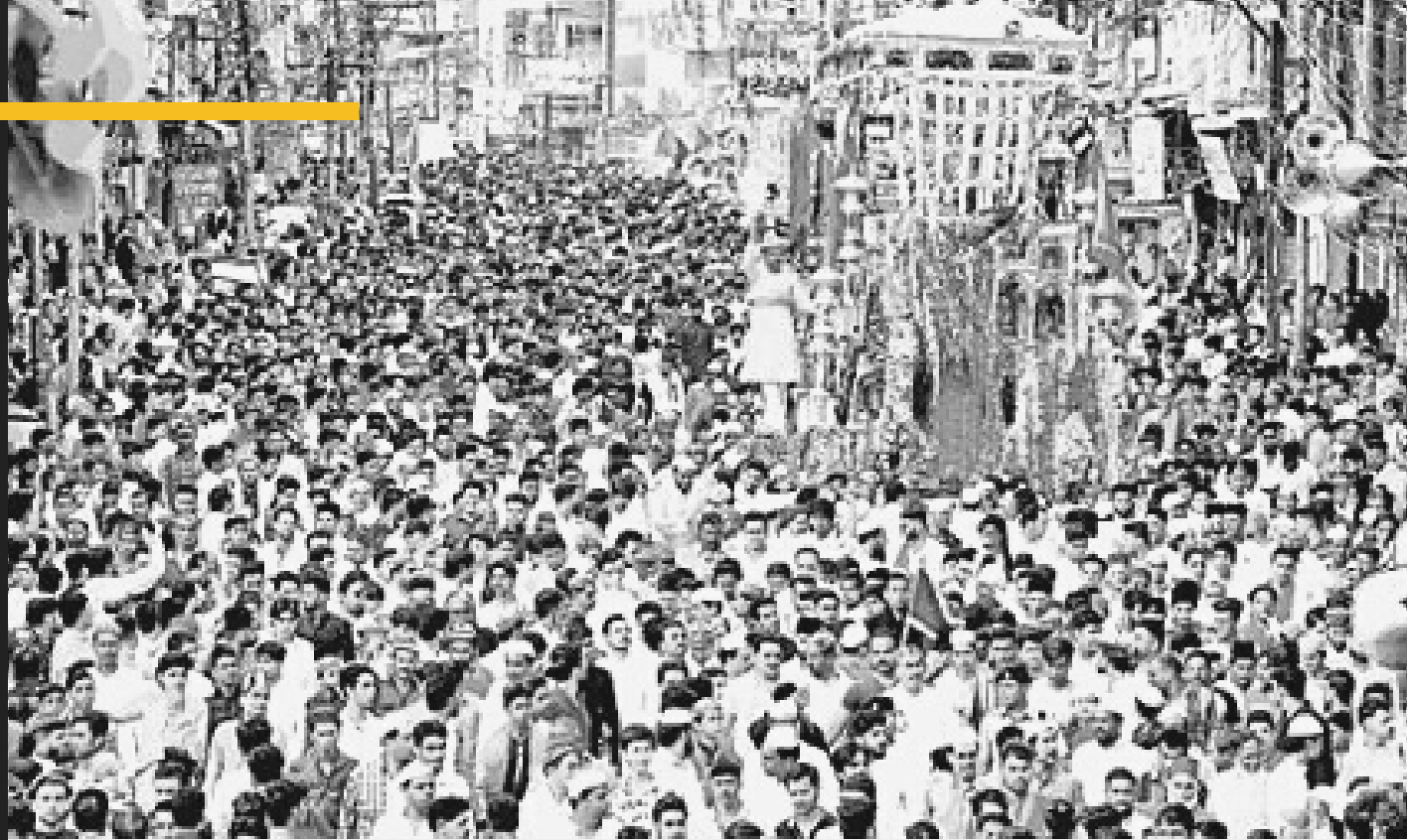
Chup Taziya, Indore, India

"SILENCE IS AN ORNAMENT. GREED IS POVERTY. GENEROSITY IS PROSPERITY. MODERATION IS WISDOM." — IMAM HUSAYN