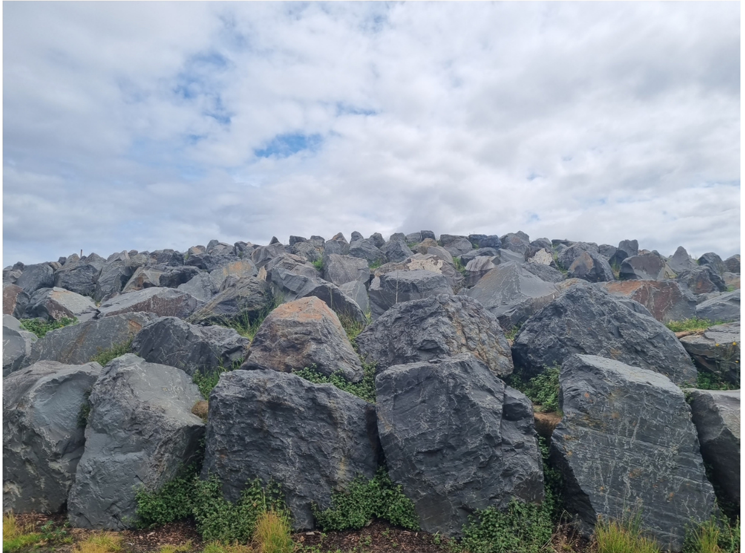
All Nations Park, Northcote