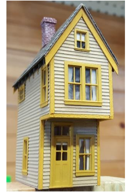
Please share your completed photos on <a href="https://www.facebook.com/ConowingoModels/">https://www.facebook.com/ConowingoModels/</a>

See <u>Conowingomodels.com</u> for more unique HO-scale structure kits.