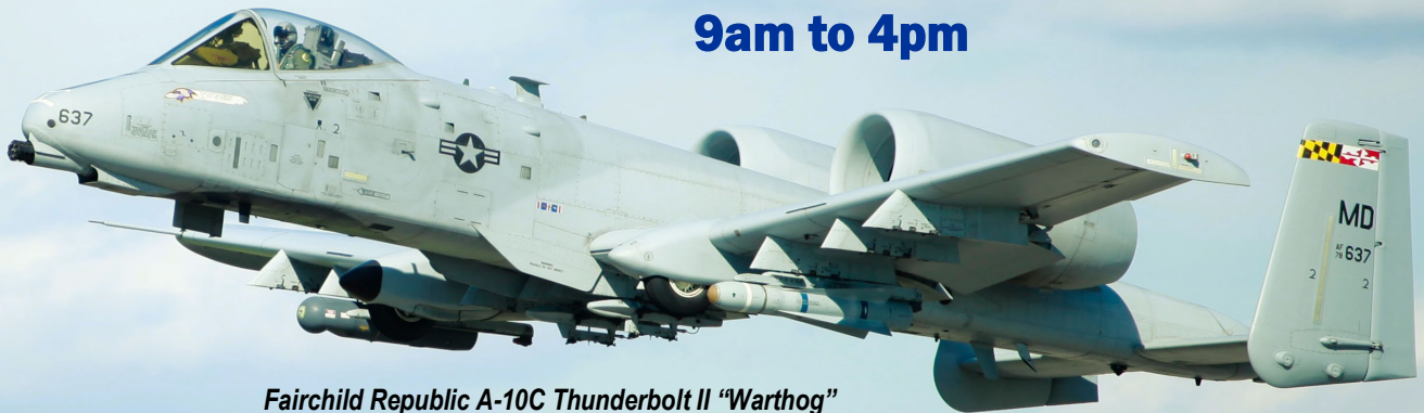
Fairchild Republic A-10C Thunderbolt II "Warhog"

See historic aircraft built in Hagerstown from 1919 to 1984 Maryland Air National Guard Two Fairchild A-10s on display! West Virginia Air National Guard C-17 Flyover after 10:30am Hagerstown Regional Airport 90th Anniversary Open House Hagerstown Aviation Museum Historic Fairchild Aircraft Exhibits Fairchild C-82 & C-119 Flying Boxcar, Antique & Modern Aircraft Fairchild PT-19 Airplane Rides, Douglas DC-3. 2018 Jeep Raffle Drawing at 3pm Delaware Aviation Museum B-25 Bomber Rides! Air Heritage Museum C-123K "Thunder Pig" Berlin Airlift Historical Foundation C-54 "Spirit of Freedom" Civil Air Patrol Aircraft Display Experimental Aircraft Association Chapter 36 Aviation Display Cruise-In: Antique, Classic, Muscle Cars, Trucks Military Vehicles, Fire Trucks, Motorcycles & more! The New Horizons Band Concert at 1:00 pm FREE Admission, Donations Welcome - Breakfast and Lunch Available Event benefits the Hagerstown Aviation Museum & EAA Chapter 36 Location: Hagerstown Regional Airport Terminal, 18434 Showalter Road, Hagerstown, MD 21742