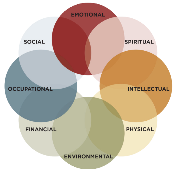
EIGHT DIMENSIONS OF WELLNESS*

We also recognize that we live in a multicultural world, and wellness encompasses areas that may not be specified in this brief discussion. We believe, for example, that trauma is a universal human experience, and that our culture and spiritual beliefs impact our perceptions and everything we do. In summary, wellness is about how we live our lives and the joy and fulfillment and health we experience.