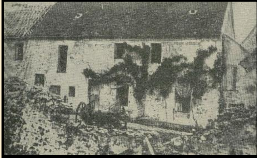
The 6th Regiment Aid Station in Petit Montgivault

The regimental aid station was located in a building near the regimental post of command. During the battle of Belleau Wood, for example, the 5th Marine Regimental aid station was in a barn across the road from the regimental PC in La Voie du Chatel. However, the 6th Regiment leadership took a very pragmatic approach to their location, and the 6th Regimental Aid Station was located in a very forward position at the Petit Montgivault Farm across the road from Montgivault Grande, a PC that traded hands between 1/6 and 2/6. The regimental surgeon and his assistant surgeon along with the senior dentist headed the staff. It was from these locations that the Regimental Surgeon and his staff kept track of the locations, needs, and staffing of the company and battalion aid stations.