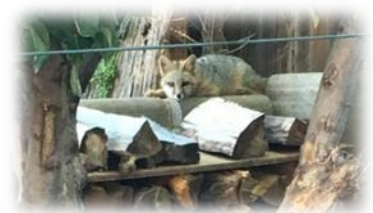
Gray fox in Pueblos de Rodeo Road backyard.