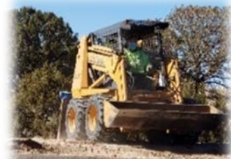
M&M preparing median for gravel work near west entrance of Pso De Los Pueblos.

block walls that have received non-matching brown and gray paint patches in the past decade.