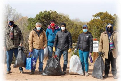
Pueblos de Rodeo Road residents helping to pick up trash along the Pueblos Del de Rodeo Road Greenbelt during the Great American Cleanup Day on April 17.

Please be assured that our HOA Secretary, the Directors and Officers take the security and privacy of our members very seriously and work hard to protect it and continue to do what they can to prevent problems in the future.