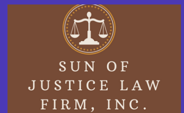
Sun of Justice Law Firm, Inc