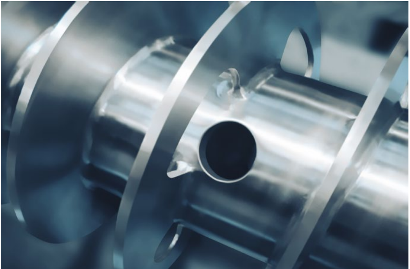
Application-driven scroll design