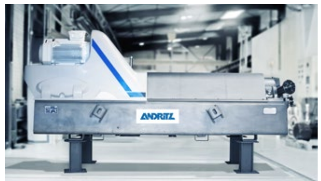
ANDRITZ decanter centrifuge F

While you are saving time in production, there is no need to lose time during maintenance! The in-line design of our ANDRITZ decanter centrifuge F allows easy dismantling (requiring only basic lifting equipment and an operator). This configuration provides cost savings in maintenance and handling.