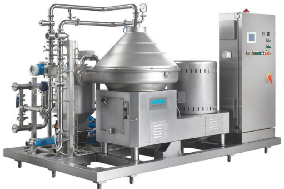
▲ Wine clarifier skid

After tartaric stabilization, tartrate crystals can be removed from the product with a clarifier. In order to avoid abrasion, ANDRITZ SEPARATION provides special wear protection on the sliding piston and clips on the bowl ejection ports, which extend the mechanical life of the clarifier.