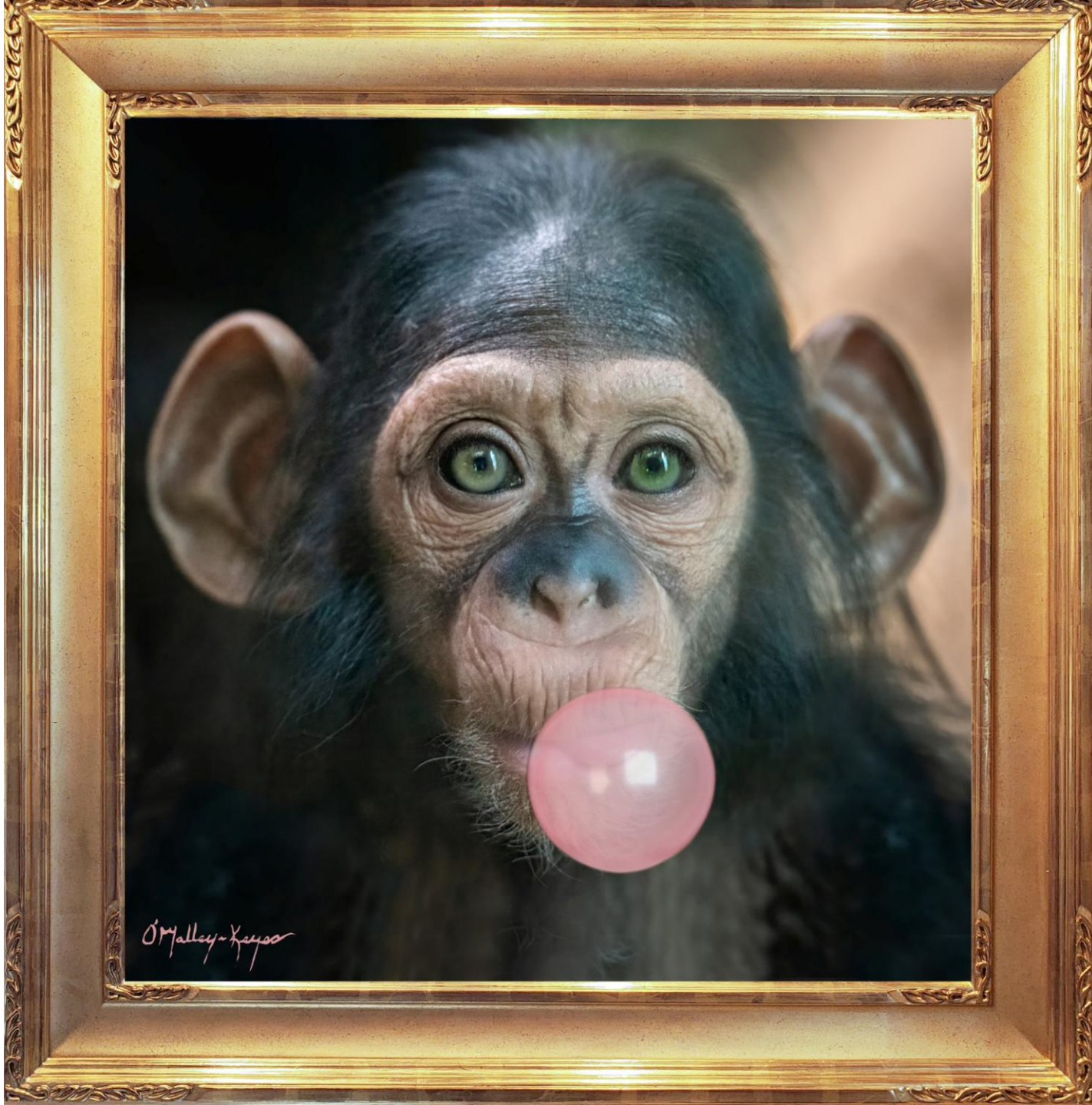
"MY COUSIN VINNIE" 30X30 OIL ON LINEN $14,500 UNFRAMED

Primates are endlessly amusing creatures, often behaving in ways that are strikingly similar to humans, making them both entertaining and fascinating to observe. From chimpanzees playing pranks on each other to orangutans using tools in surprisingly clever ways, their antics reveal a deep intelligence and a sense of humor that feels almost human. They laugh, tease, sulk, and even throw tantrums, much like children, reminding us just how closely related we are. Watching a monkey steal a tourist's sunglasses or a gorilla dramatically roll its eyes at a zookeeper feels like looking into a funhouse mirror—an exaggerated yet familiar reflection of our own quirks and social behaviors. Their playful mischief and expressive personalities make them some of the most delightful and relatable animals on the planet.