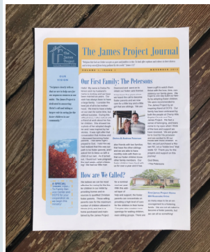
First newsletter with the original logo!