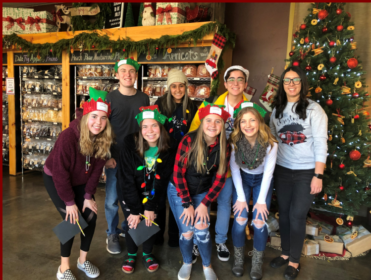
1st Place: Bella Viva Orchards