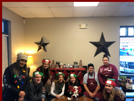
Honorable Mention: Main Street Deli and Bakery