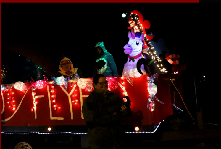
Children's Best of Show: Hughson Assembly of God Mountain Movers