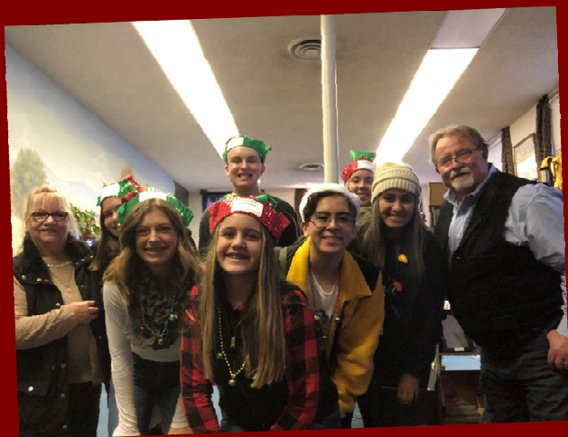
3rd Place: Hughson Historical Society/Museum