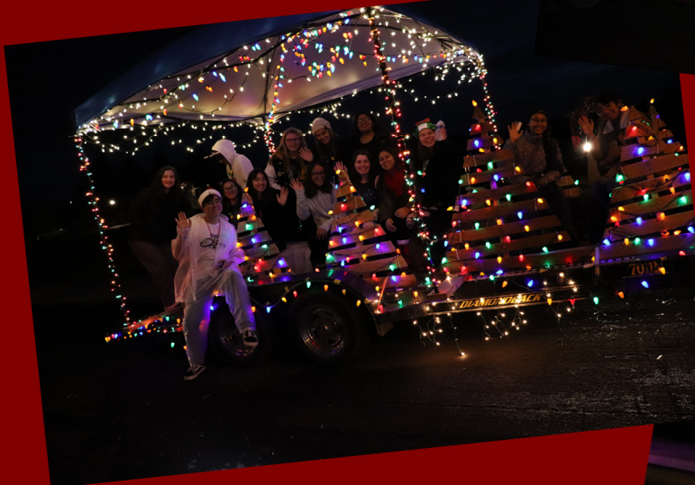
2nd Place: The Hispanic Youth Leadership and Key Club