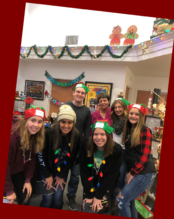
2nd Place: RelInvent Art Studio