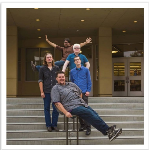
Big Earl's Poorhouse Millionaires