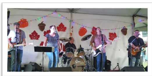
Cover 5 Band