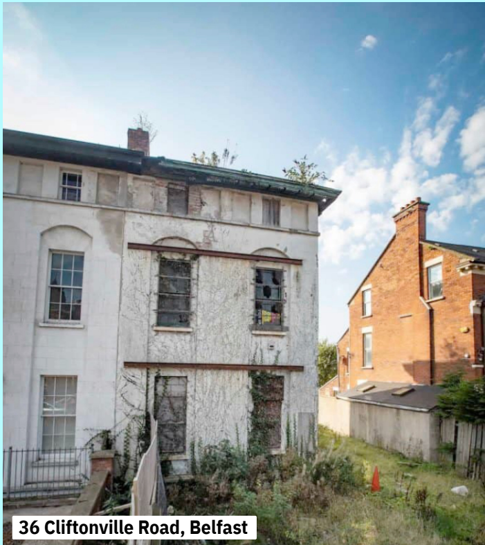
36 Cliftonville Road, Belfast

T HE history of 36 Cliftonville Road and its inhabitants reflects the development of the North Belfast area we now know as Cliftonville.