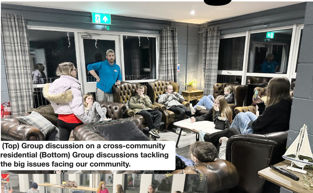
(Top) Group discussion on a cross-community residential (Bottom) Group discussions tackling the big issues facing our community.