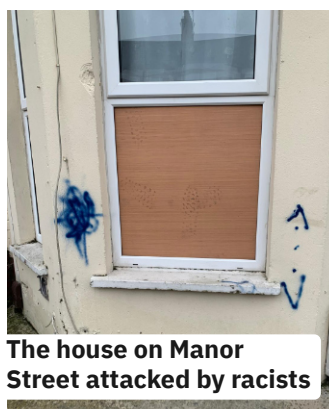
The house on Manor Street attacked by racists

A HOUSE on Manor Street was attacked by racists on Wednesday 13 th November.