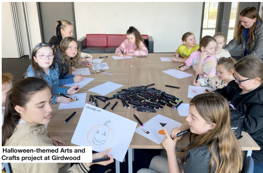
Halloween-themed Arts and Crafts project at Girdwood

It was a fantastic success, featuring activities like arts and crafts, football, and drama, which brought together young people from