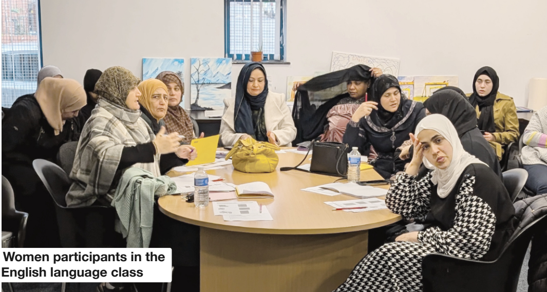
Women participants in the English language class

WOMEN from ethnic minority communities living in the Cliftonville area are learning to speak English.