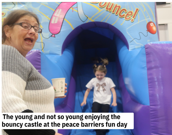
The young and not so young enjoying the bouncy castle at the peace barriers fun day

This year, the Imagine Peace Barriers Project is proud to celebrate 11 years of work dedicated to building bridges and fostering positive change in our communities.