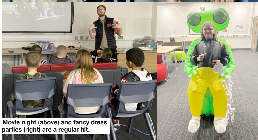
Movie night (above) and fancy dress parties (right) are a regular hit.