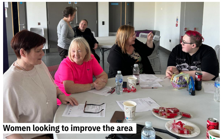
Women looking to improve the area

Over the years, we have launched several initiatives to bring our communities closer. One of our exciting projects is the Imagine