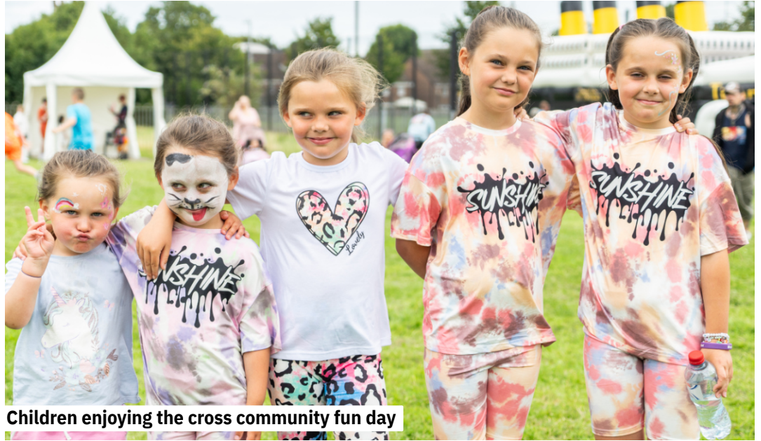
Children enjoying the cross community fun day

The feedback showed significant improvements, though concerns around anti-social behaviour (ASB) at the interface remain.