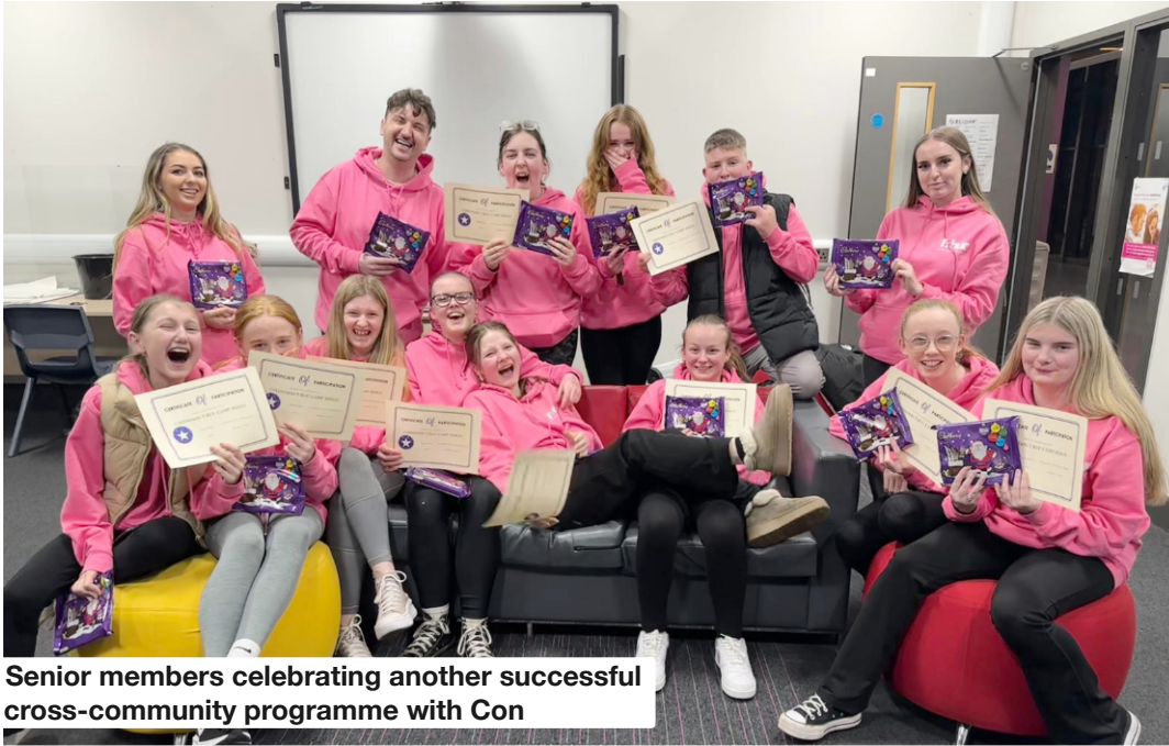
Senior members celebrating another successful cross-community programme with Con