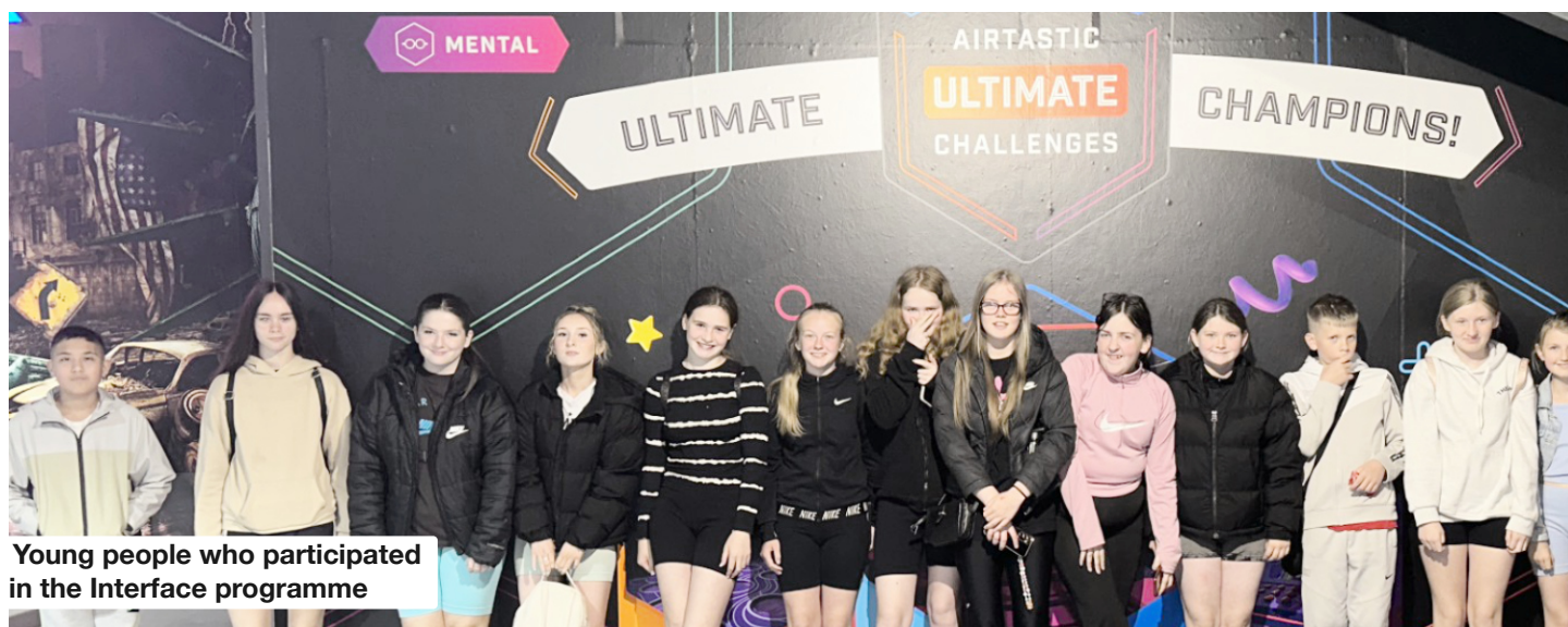
Young people who participated in the Interface programme