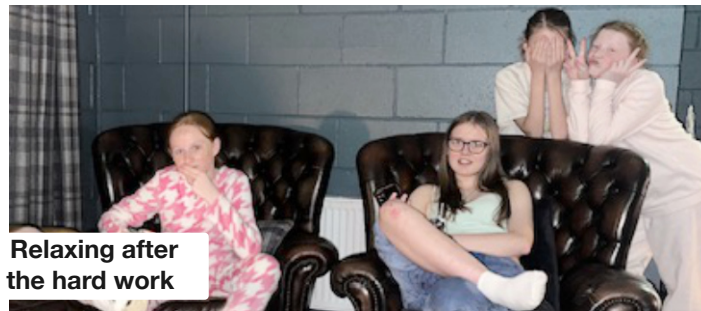
Relaxing after the hard work

Spider-man scaling every, single side of the climbing wall.