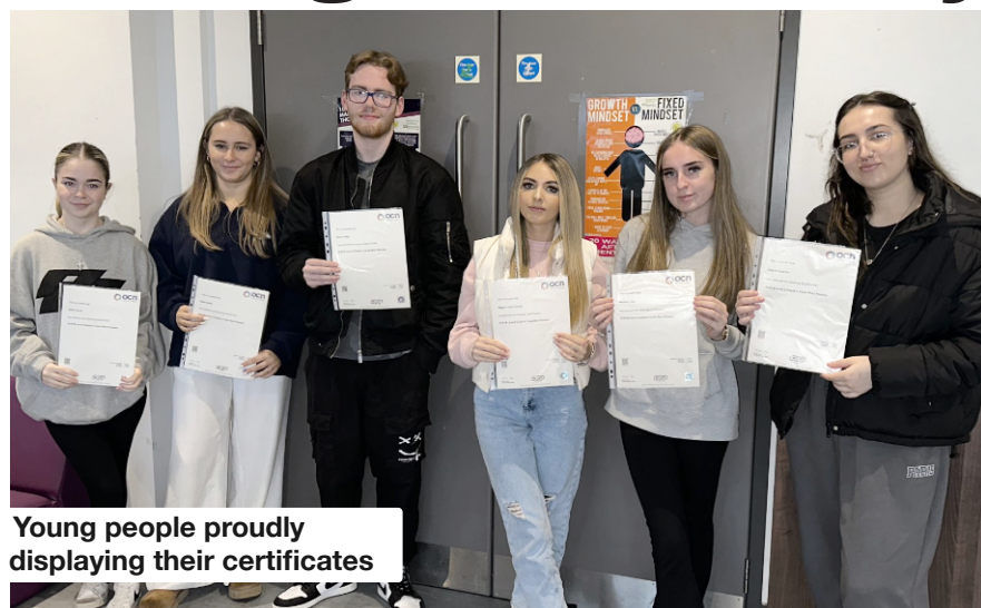
Young people proudly displaying their certificates

A HUGE well done to our young leaders on achieving their Level 2 in Youth Work Studies.