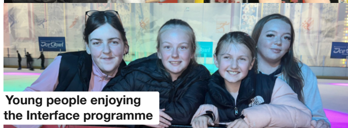
Young people enjoying the Interface programme