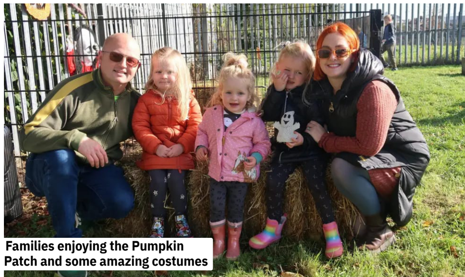
Families enjoying the Pumpkin Patch and some amazing costumes