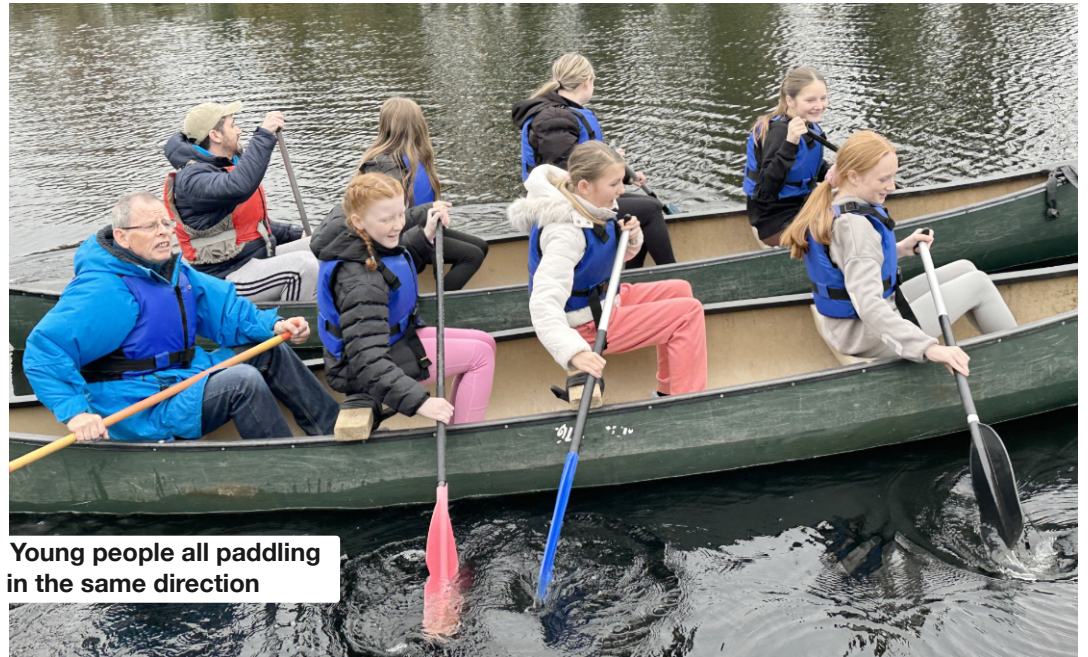
Young people all paddling in the same direction