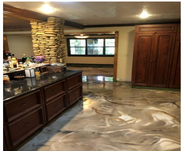
Tru-Flow 3D Metallic Epoxy applied at 55-60 sq. ft per gal

Warranty: Material only if proven defective, no labor