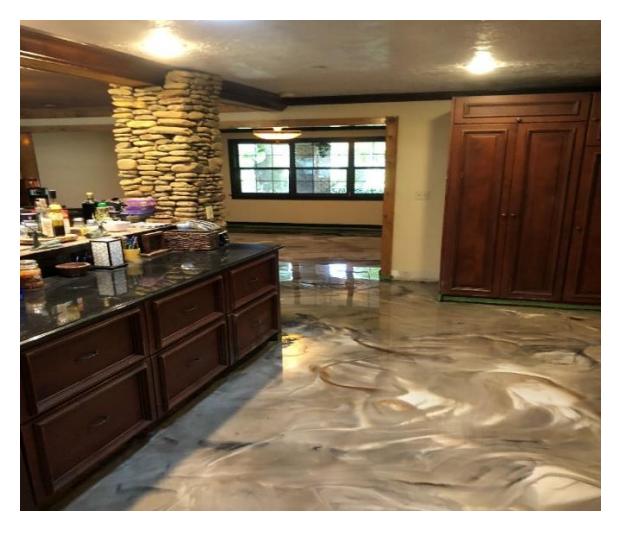
Tru-Flow 3D Metallic Epoxy applied at 55-60 sq. ft per gal

Warranty: Material only if proven defective, no labor