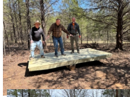
The Magic Carpet