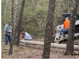
Lodge Pole Balance