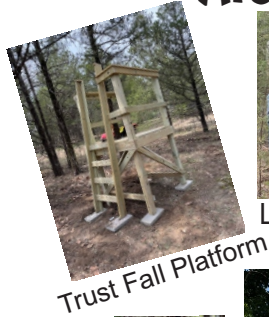
Trust Fall Platform