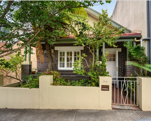
214 Young Street