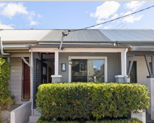
20 Wells Street