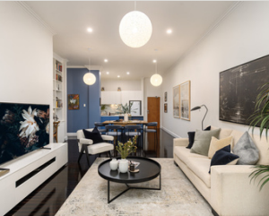
15/62 Booth Street