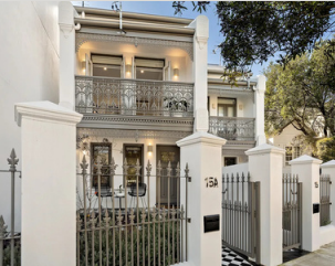
15A Albion Street