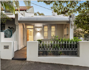
238 Annandale Street