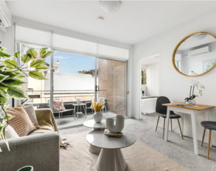
20/268 Johnston Street