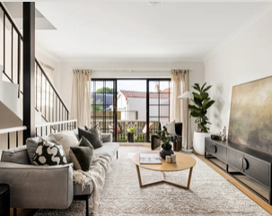
3/236 Johnston Street