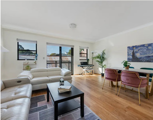
12/47 Trafalgar Street