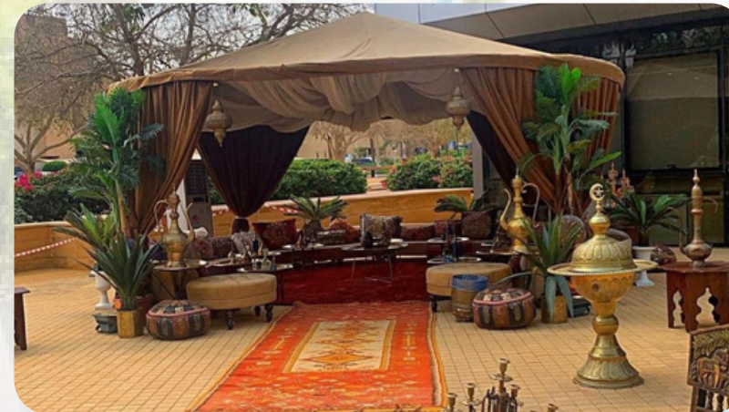
S2 – umbrella