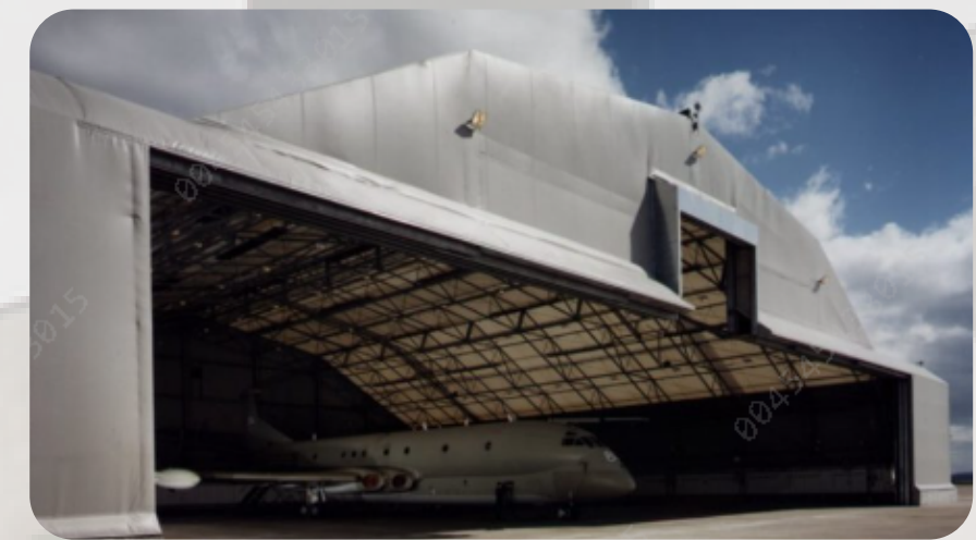
M4 - Structer

allows for more interior space over the full width of the building. Making the idel soultion for sports buildings and air plane hangers,