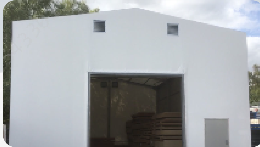
M1 - Structer

a popular choice for bulk Storage and can be customized in varity of conditions and ways, also can be linked to create multiple span building