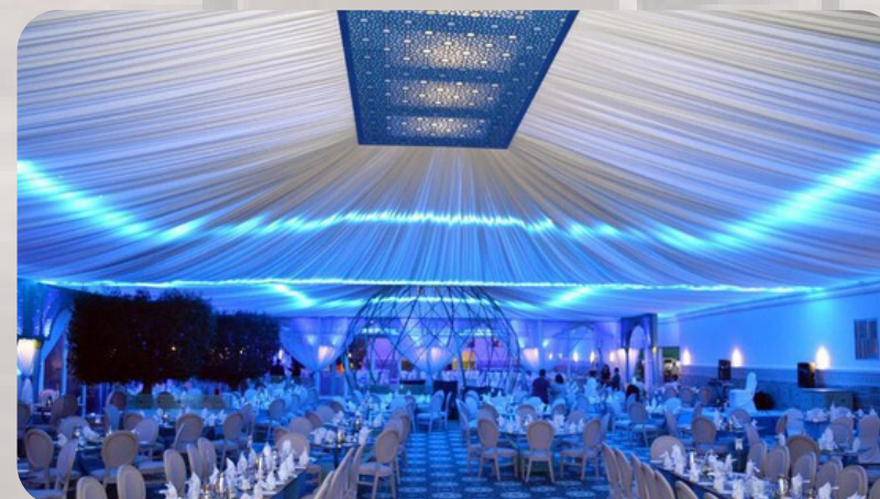
C3 - Dinning Tent

Whatever your space, PALACETENT has a tent for your restaurant. We know that during these times of abundant caution, you want your guests to feel safe and at home in your premsise, our tents offer endless opportunities.