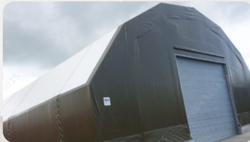
M3 - Structer