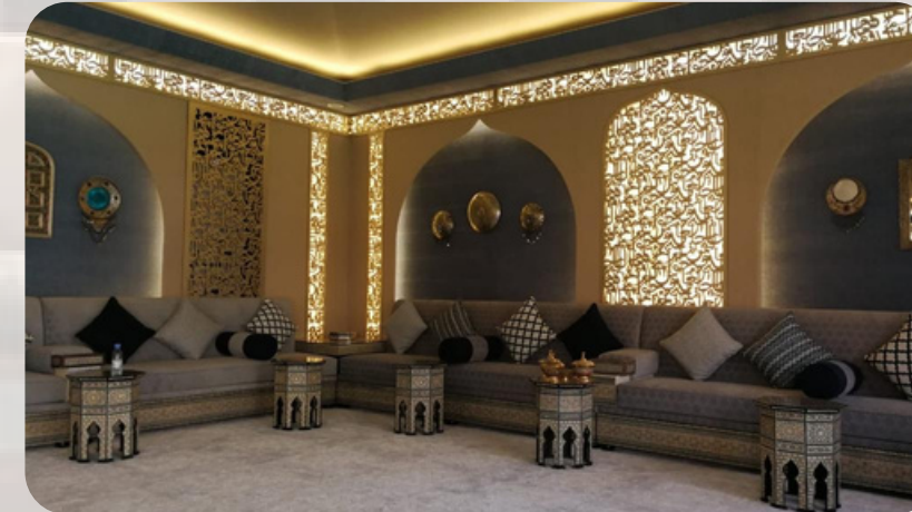
P5 - Moroocan Tent