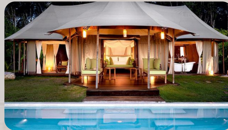
H1 – Chalet Tent

a chalet is a building that features dining areas, spas, and other tourist-focused amenities . it's a spot for vacation or relaxsaying purpose.