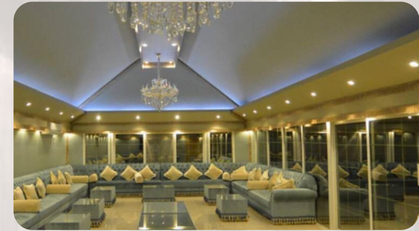
P3 - VIP Tent