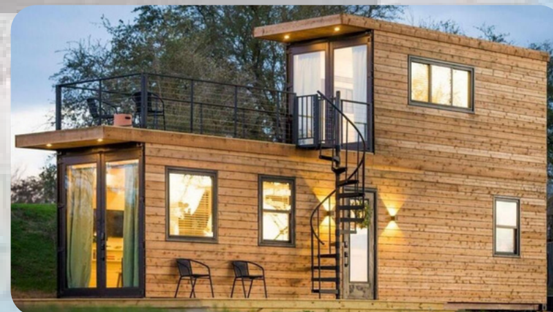
H3 – Container home

PALACETENT Containers builds custom shipping container homes out of a combination of stacked and adjoined shipping container houses. Each container home is unique with special design as required