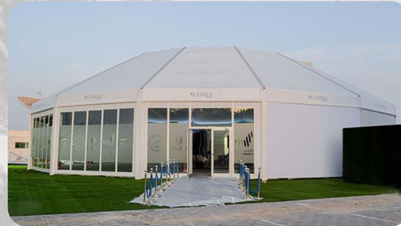
C1 - DOME TENT

Here's a few ideas to spark your imagination and create a buzz around your event and brand. Domes create an immersive and interactive environment to showcase your latest commercial models.