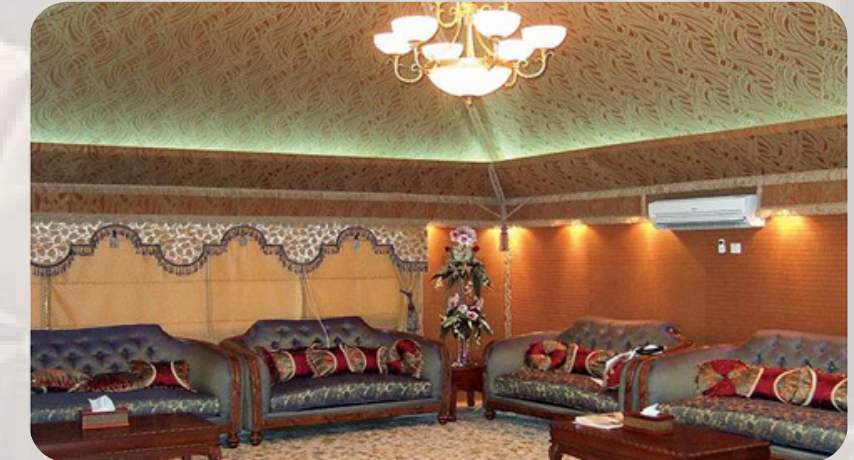
P6 - Emirates Tent