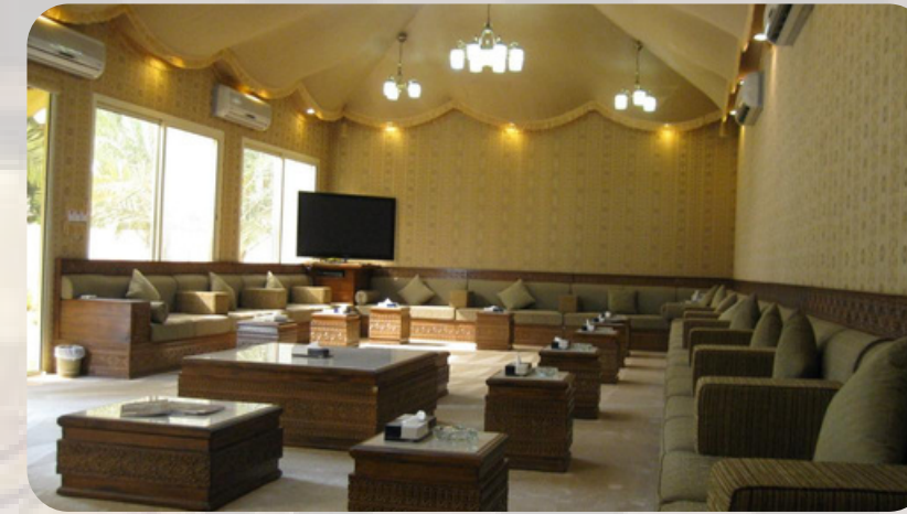
P2 - Super Royal Tent