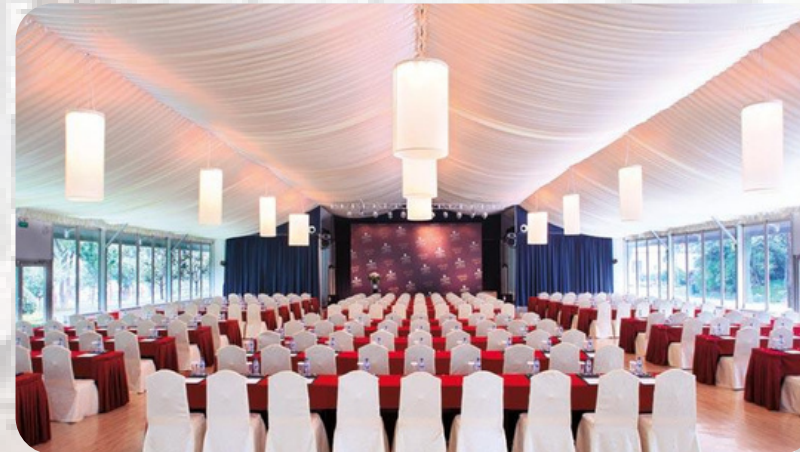
C2 - EVENT / Conferance Tent

PALACE TENT Experts will be happy to assist you in the proper tent selection for your event. No matter what type of tent you need. all set-up will be prepare and solve all obstacles.