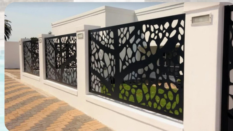
S3 – Screen

Benefits of a Privacy Screen. Like a fence, these walls can block off an area from unwanted pests gaining entry or utilize to get more privacy in your place