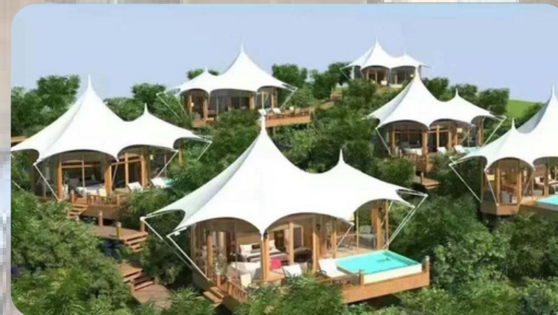
H2 – Resort Tent (Beach, Mountain, Safari)

PALACETENT specialize in creating the worlds most unique, durable and luxurious tents in the world. Whether you're creating a 5 start resort or developing a small glamping resort, you've come to the right place!