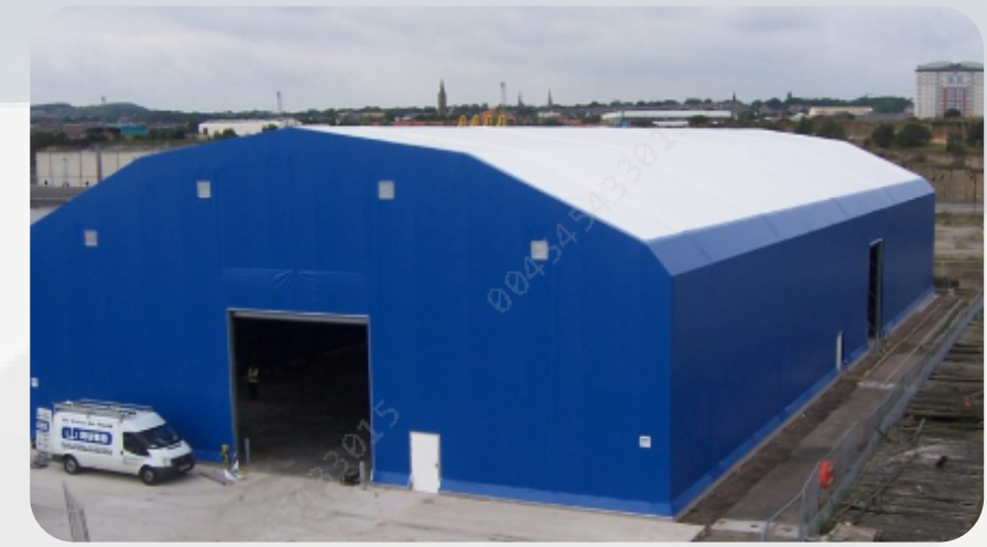
M2 - Structer

can be customized in numbers of ways. the leg can be extend for additional interior space, and the entire building can be placed on rollers for mobility