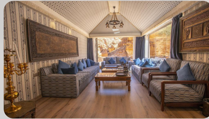
P1 - Royal Tent