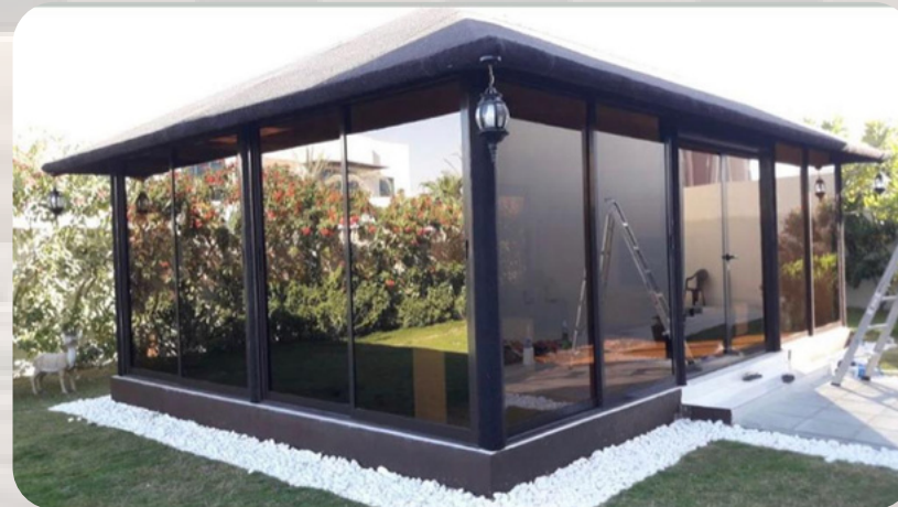
P4 - Panoram Tent