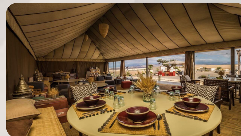
P7- Personal Dinning