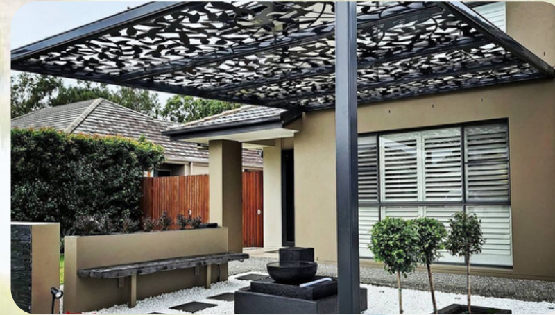
S1 – Pergola

Is an outdoor structure that may be freestanding or attached to a home or building forming a shaded walkway, passageway, or sitting area of vertical posts or pillars that usually support cross-beams and a sturdy open lattice