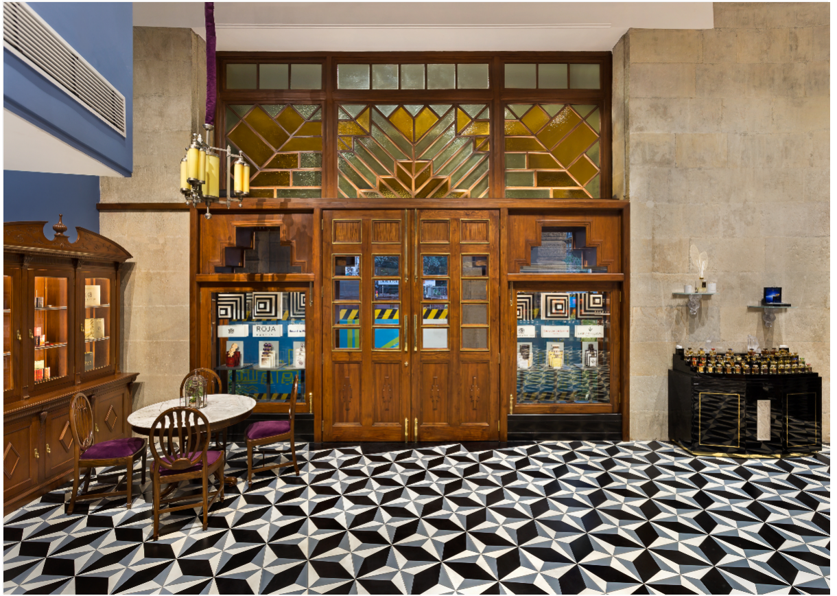
Mumbai: This store houses a few of the world's most expensive perfumes