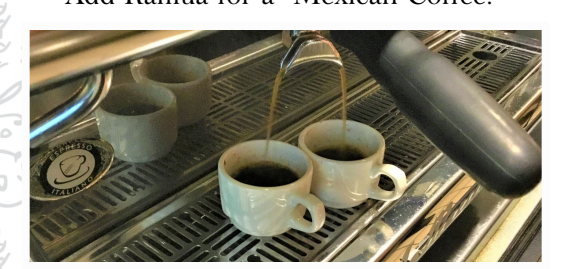
ESPRESSO Single 3 Double 5 Anderson's espresso beans, slow roasted for a deep & luring flavor. Add Avion Espresso for a kick!